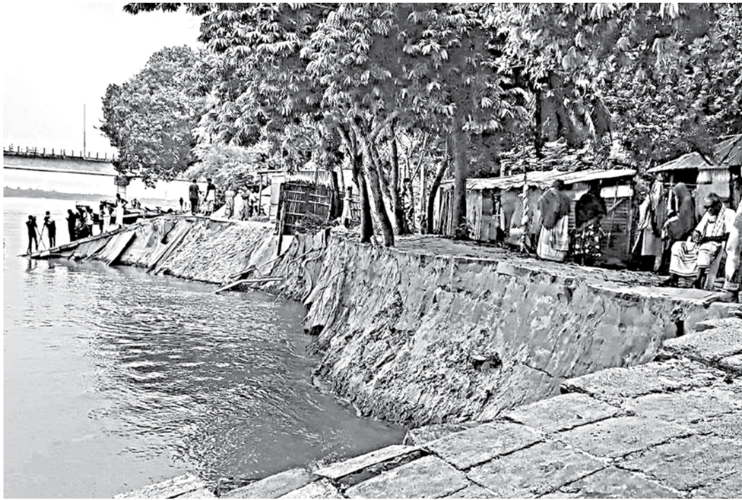
With the Sheikh Russell Bridge visible several hundred feet away, a large section of the bridge's protection embankment has eroded away by the Gorai river in Haripur union of Kushtia Sadar upazila. The photo was taken recently.

They wrote to the higher authorities last year for necessary funds for the repair work and they hope that the funds would be allocated soon, he also said.