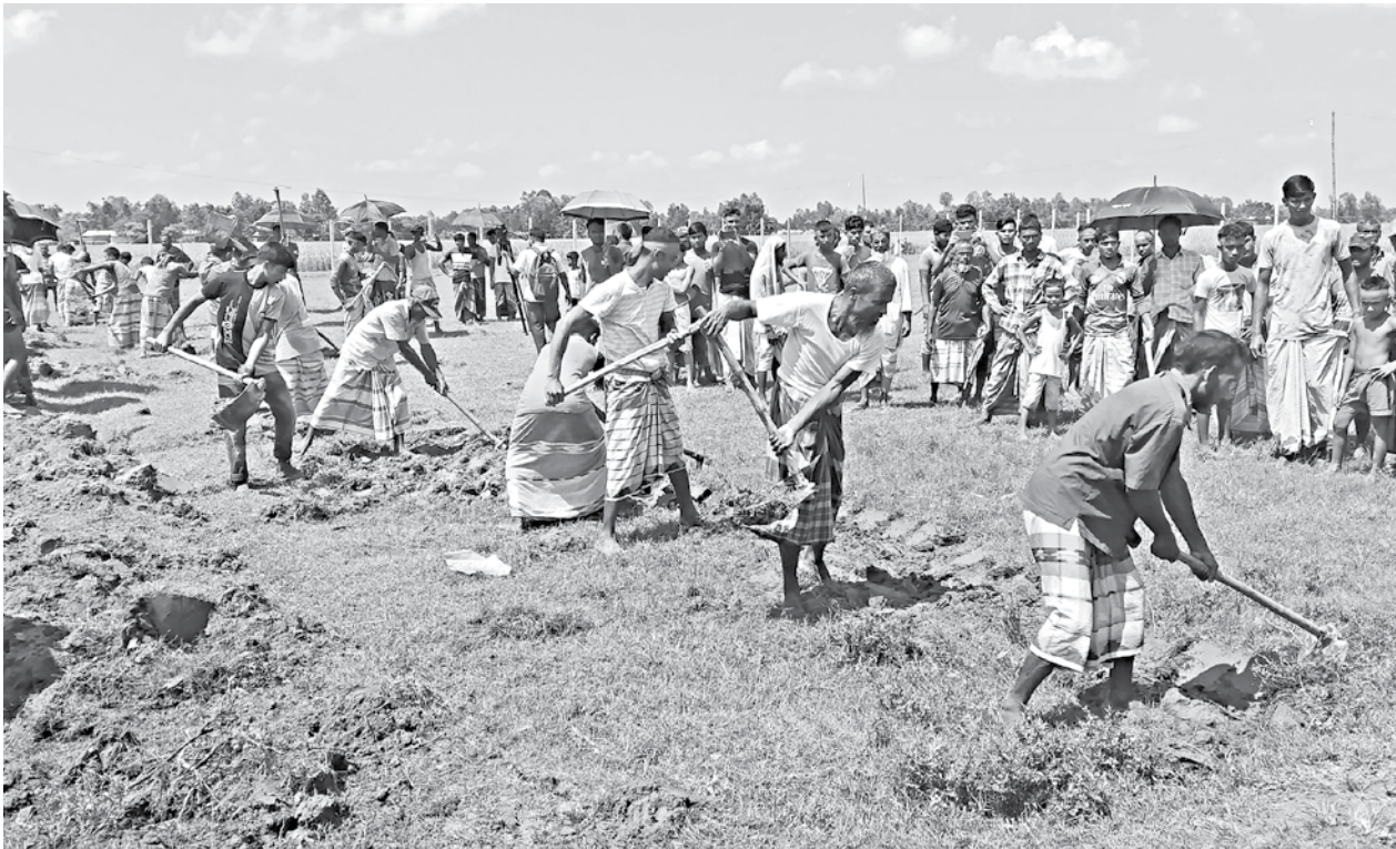
Finding it extremely difficult to move, the people Char Sholmari on the Teesta river basin in Bhoatmari union under Kaliganj upazila of Lalmonirhat took spades on their hands to reclaim and repair a government road that was under the illegal possession of a private solar power company.

They wrote to the higher authorities last year for necessary funds for the repair work and they hope that the funds would be allocated soon, he also said.