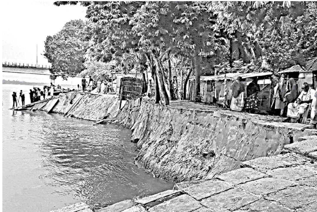
With the Sheikh Russell Bridge visible several hundred feet away, a large section of the bridge's protection embankment has eroded away by the Gorai river in Haripur union of Kushtia Sadar upazila. The photo was taken recently.