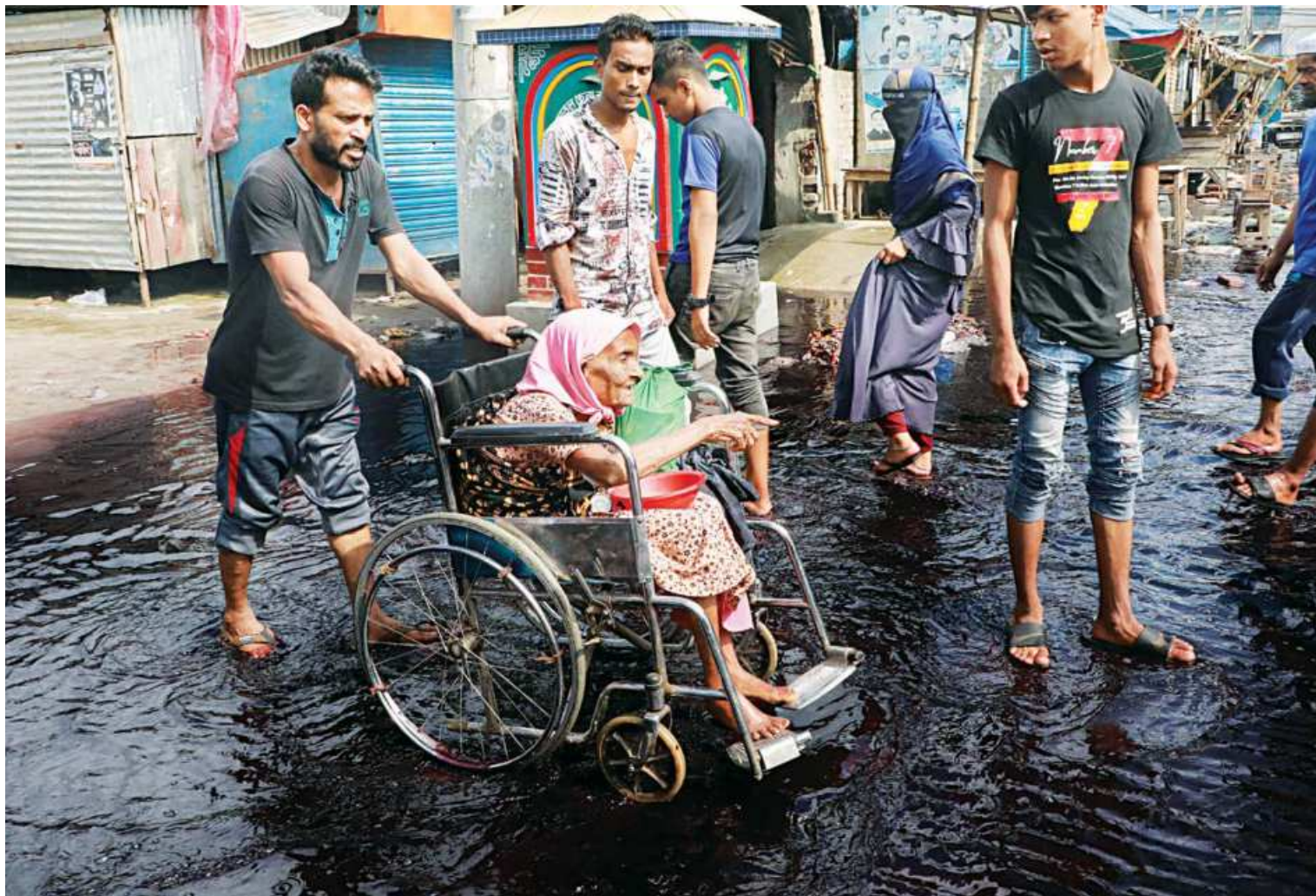
Locals helping an elderly woman on a wheelchair cross the road in Shyampur Industrial Area in the capital yesterday. Due to ongoing development work in the locality, waste from a nearby dyeing factory got diverted to the street, flooding the area for about a week.