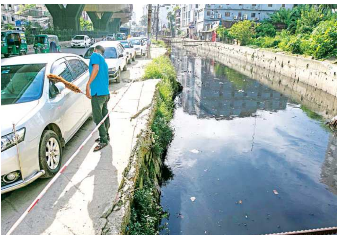
Only a flimsy tape protects this man, dusting the window of a car, from the wide open drain in Chattogram's Muradpur area. Many of the open drains in the port city do not even have that tape. Such open drains pose serious hazards for pedestrians. The photo was taken on Tuesday.