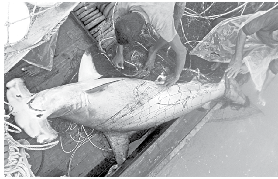
Fishermen in Bangladesh are being trained to record and safely release threatened sharks and rays.

Working for nearly two decades on advancing the protection of marine wildlife in Bangladesh has taught us that we need innovative solutions grounded in robust science, and developed jointly with the communities dependent on marine resources.