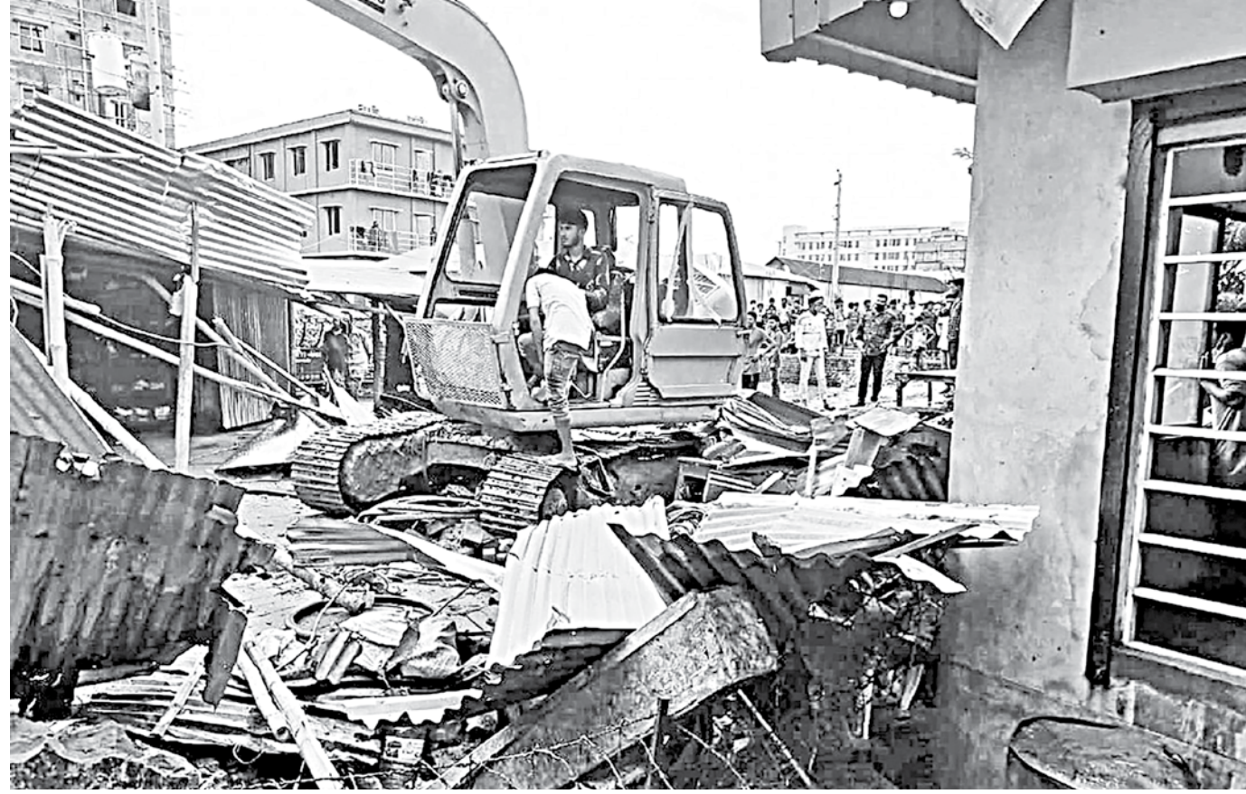
Blatantly disregarding law and court order, an excavator owned by the Gazipur City Corporation demolishes homes to make space for the city corporation's development projects. The photo was taken over a month ago.

A report published by The Daily Star on September 26 elaborates the sufferings of the property owners whose lands are being encroached by the GCC authorities. To quote from the report,