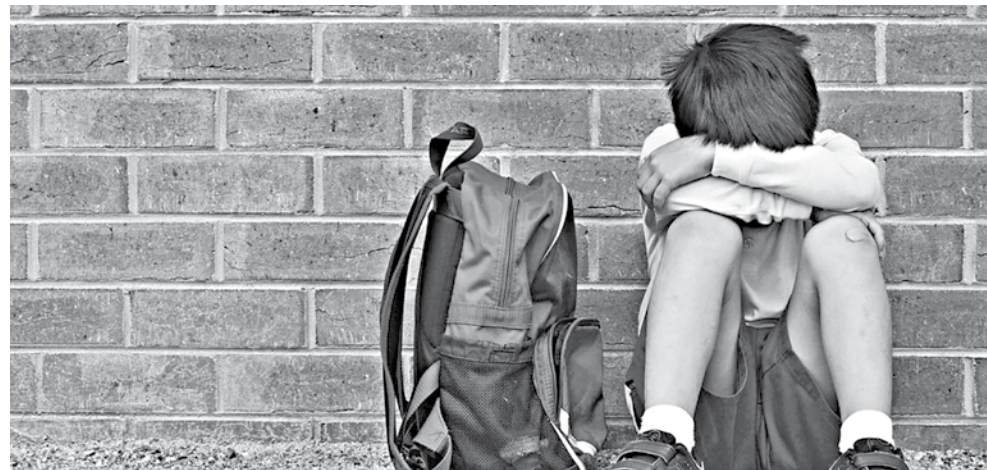
The culture of bullying that plagues our schools needs to be dealt with properly.

Looking back, what surprises me the most is that no mature adult in the school intervened. No one ever confronted my abusers. I suppose a scholarship student who