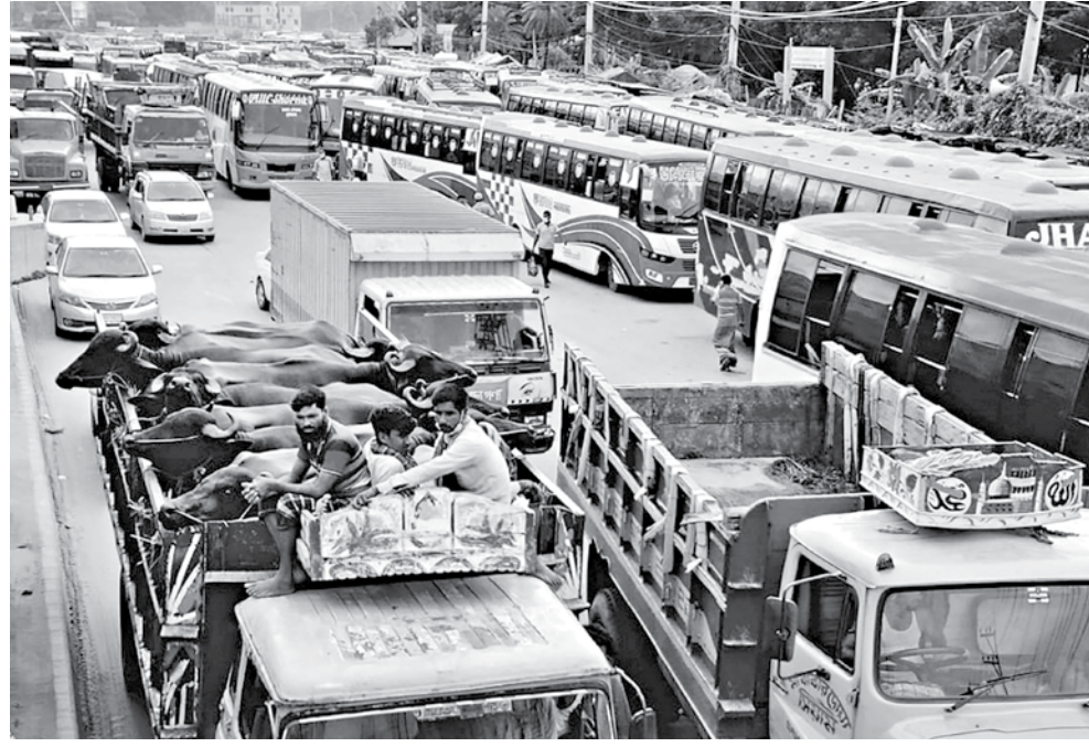
A modern city is equipped with a functioning, commuter-friendly road system. Gazipur needs that desperately.

The GCC authorities, in recent years, have been putting in increased efforts to improve the condition of the city roads and drains. But the challenges of maintaining domestic water supply, street lights, sewerage, and garbage