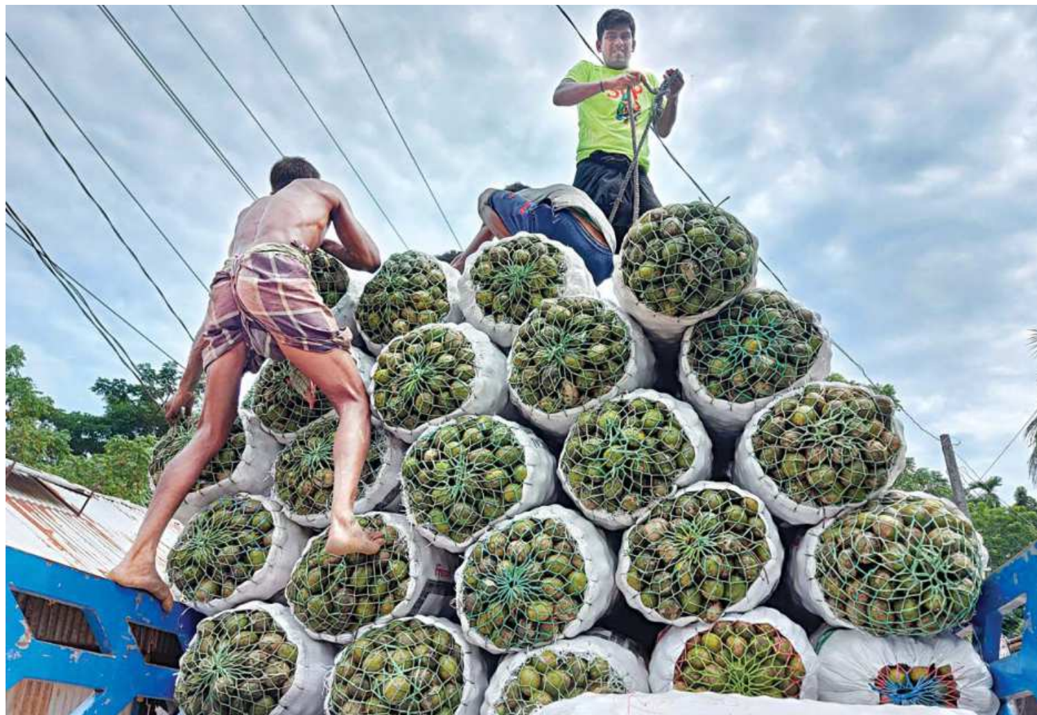
Barishal division is widely known as the hog plum capital of Bangladesh. Here, the sour fruit locally known as amra is currently being sold for between Tk 900 and Tk 1,200 per maund. Hog plums produced in the region's Pirojpur and Jhalakathi districts have considerable demand, making scenes such as this commonplace as wholesalers from all over the country come to collect the fruit. The photo was taken recently from Atghar Bazar of Pirojpur.