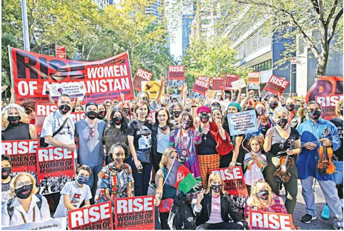
People participate in a Solidarity With Afghan Women rally outside the United Nations headquarters, during the 76th Session of the UN General Assembly, in New York, US on Saturday.

AFP, Pristina Prime Minister Albin Kurti of Kosovo accused neighbouring Serbia of trying to "provoke a serious international conflict" after two vehicle registration offices near their border were attacked early Saturday. The increase in tension occurred on the sixth day of ethnic Serb protests against the ethnic Albanian-led government's decision to require drivers with Serbian registration plates to put on temporary ones when entering Kosovo. A registration office was torched in the small town of Zubin Potok and another damaged in Zvecan, though there were no casualties, the prime minister said.