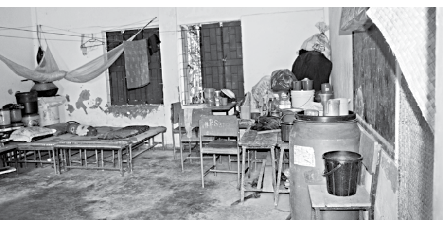
Benches are placed together to make a bed and store household items inside a classroom at Nandipara Government Primary School in Patuakhali Sadar upazila. The photo was taken recently.

The room would be vacated soon and necessary action would be taken against the headteacher concerned, he also said.