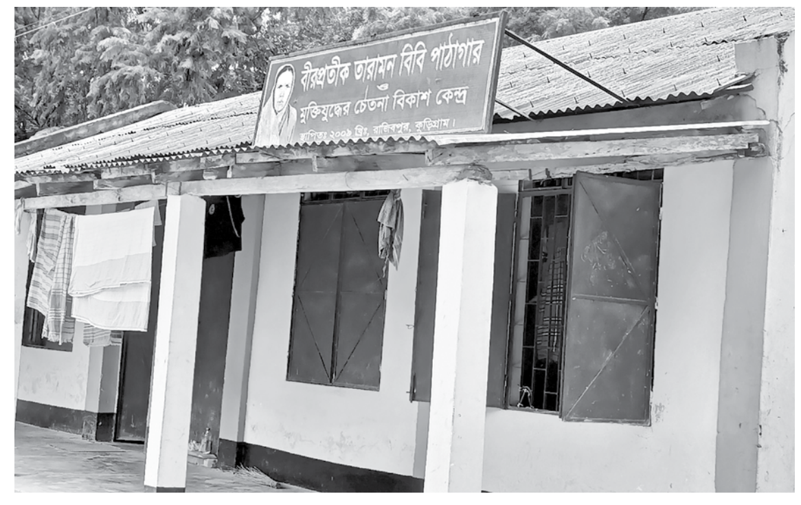
The building where Bir Protik Taramon Bibi library was established in 2009 -on the premises of Char Rajibpur Upazila Parishad in Kurigram -- is now being used to provide accommodation to Ansar members.

Taramon was born to Abdus Sobhan and Kulsum Bewa in Shankar Madhabpur village of