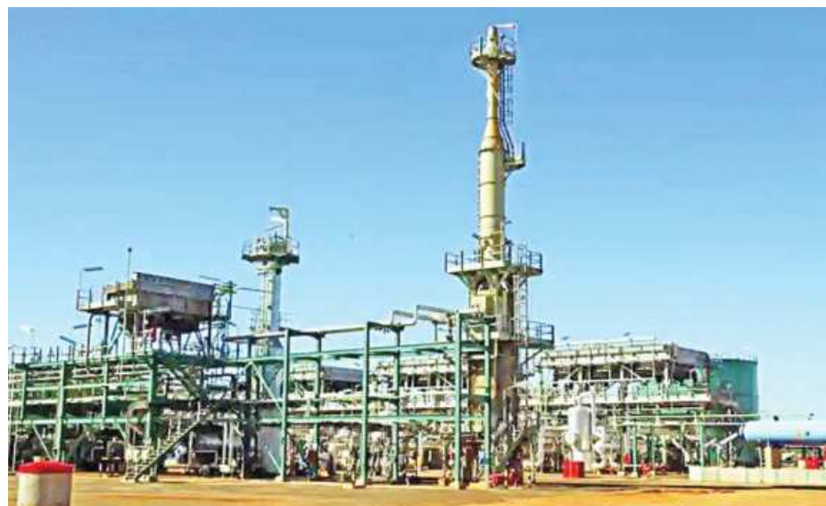
The UK already faces a lawsuit from Friends of the Earth over its financing of a gas project in Mozambique.

"The UK has been very successful in decarbonising electricity generation - emissions from the sector have halved since 2015, and solar and wind are now cheaper than existing coal and gas power plants in much of the world," read a government statement.