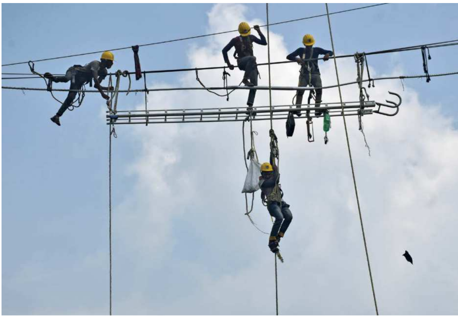
Workers of Power Grid Company Bangladesh Limited, with assistance from India's Kalpataru Power Transmission Limited, laying the 230kV line that will run from Barishal to Faridpur. The photo was taken from Barishal's Ujirpur upazila yesterday.