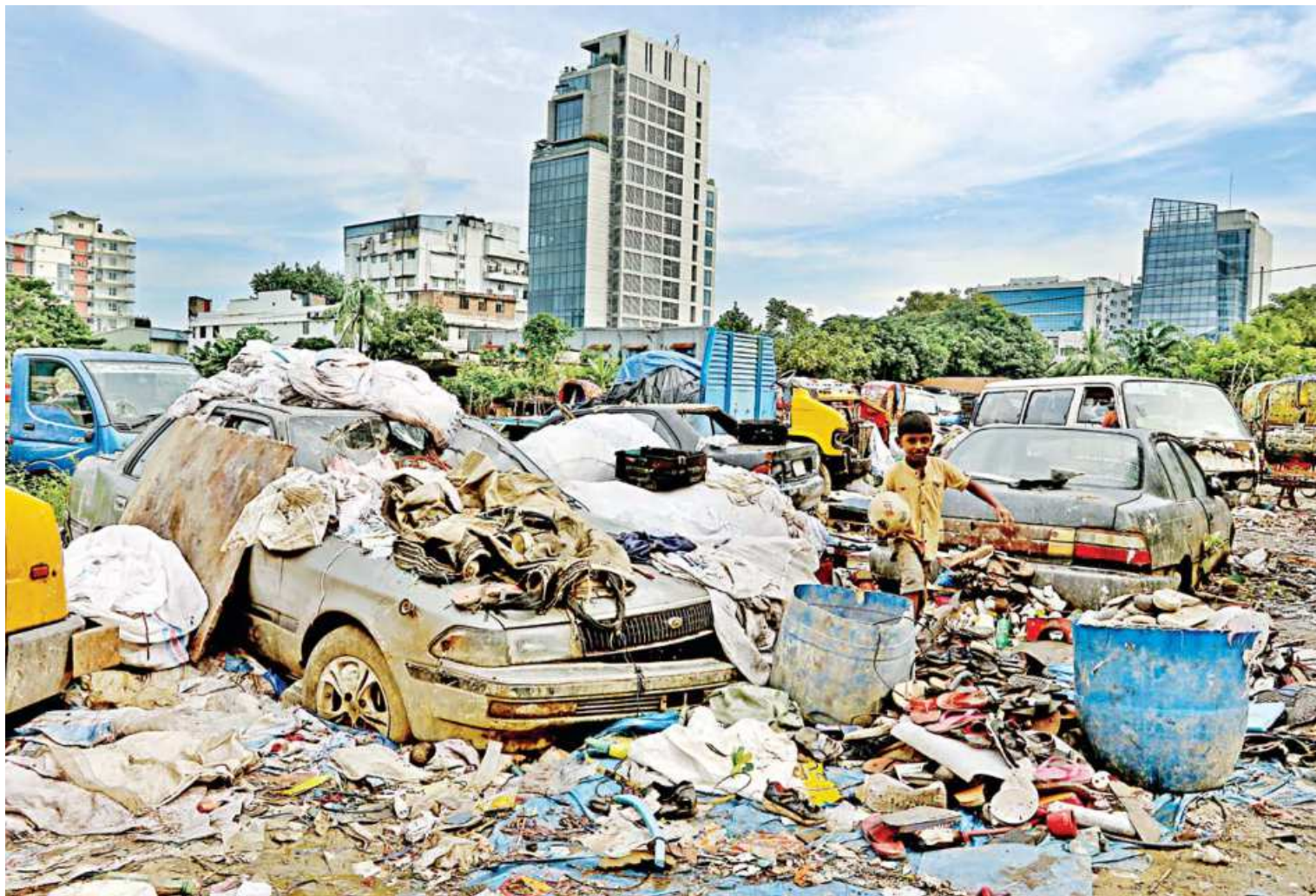
Garbage dumped on what is left of cars and other vehicles impounded at the playground of Dhaka Polytechnic Institute in the capital. Tejgaon Industrial Police has been using the playground as an impound for around three years. A child is seen retrieving his ball from the mess. Over the years, parts of the vehicles have been stolen and several rickshaw garages have appeared there. The photo was taken recently.