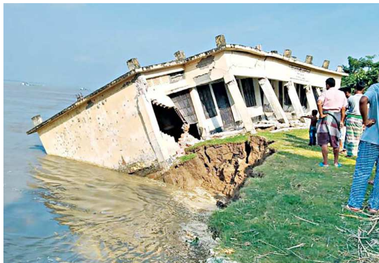
Locals watch as the building of the Char Silimpur Government Primary School is slowly devoured by the Padma in Mizanpur union of Rajbari Sadar upazila yesterday. The school, located in Char Silimpur village, was lost to river erosion between 1:00pm and 5:00pm.