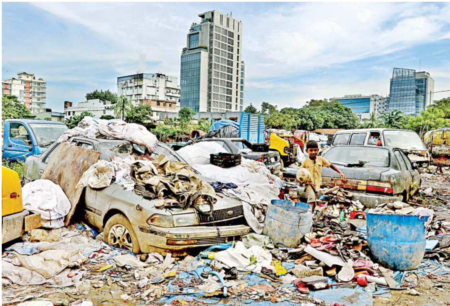
Garbage dumped on what is left of cars and other vehicles impounded at the playground of Dhaka Polytechnic Institute in the capital. Tejgaon Industrial Police has been using the playground as an impound for around three years. A child is seen retrieving his ball from the mess. Over the years, parts of the vehicles have been stolen and several rickshaw garages have appeared there. The photo was taken recently.