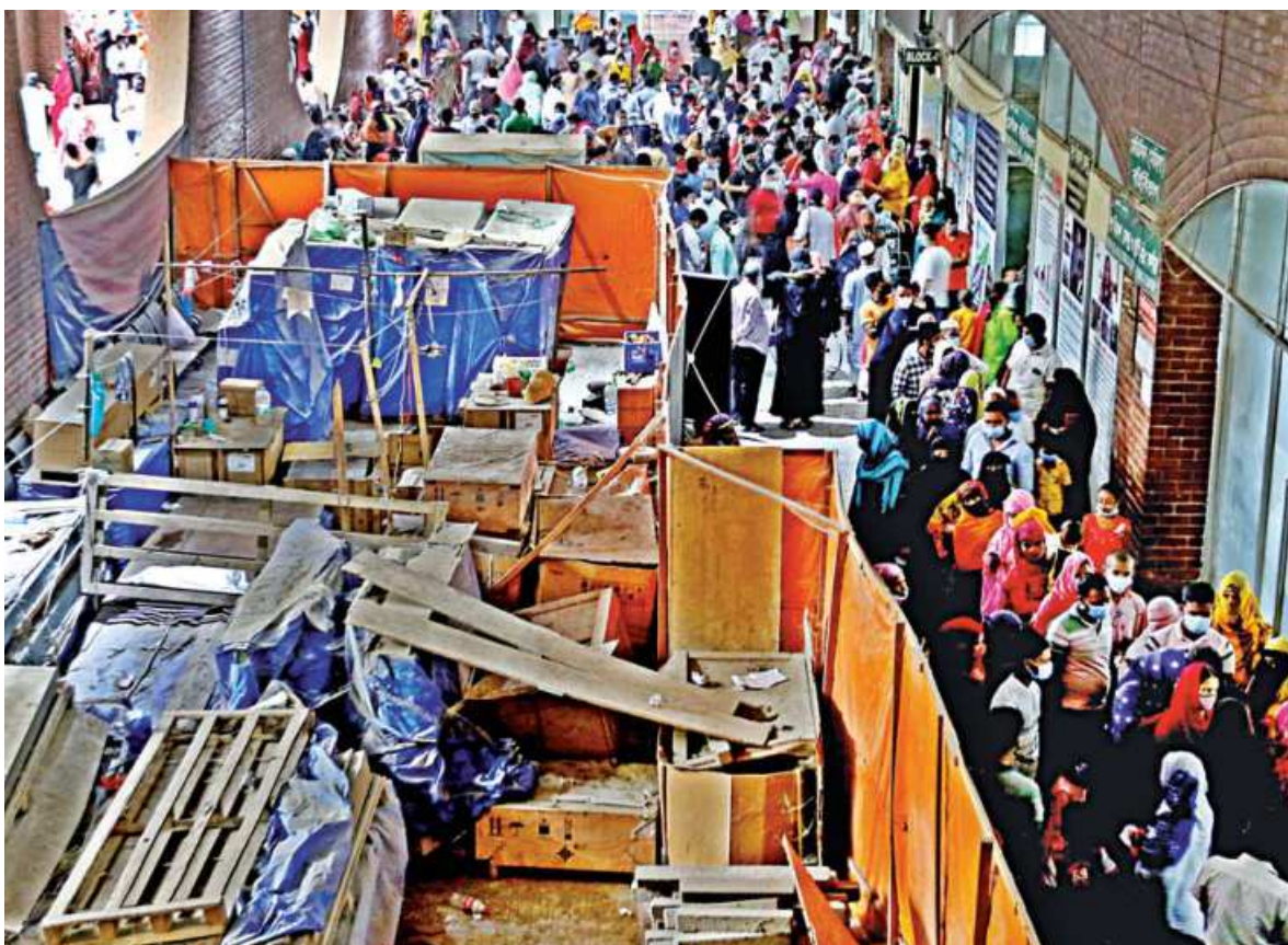
Furniture and other items used by the capital's Shaheed Suhrawardy Medical College and Hospital are left in front of the hospital's outdoor department, shrinking space for patients. As the number of patients at the hospital was high yesterday, they could not maintain social distancing.