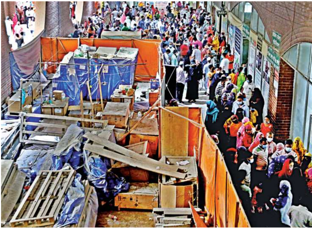
Furniture and other items used by the capital's Shaheed Suhrawardy Medical College and Hospital are left in front of the hospital's outdoor department, shrinking space for patients. As the number of patients at the hospital was high yesterday, they could not maintain social distancing.