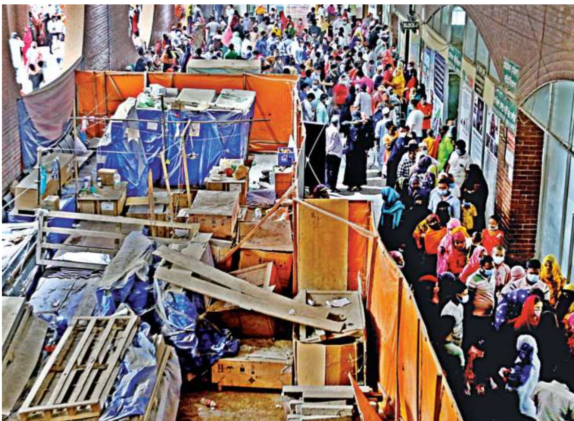
Furniture and other items used by the capital's Shaheed Suhrawardy Medical College and Hospital are left in front of the hospital's outdoor department, shrinking space for patients. As the number of patients at the hospital was high yesterday, they could not maintain social distancing.