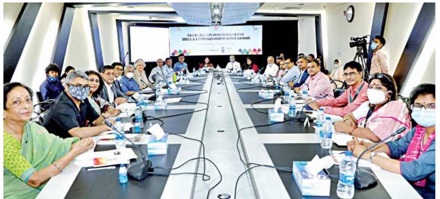
Experts attend a discussion on Sustainable Development Goals at The Daily Star Centre in Dhaka yesterday.

"That means that for about five to seven years, we did not know anything that