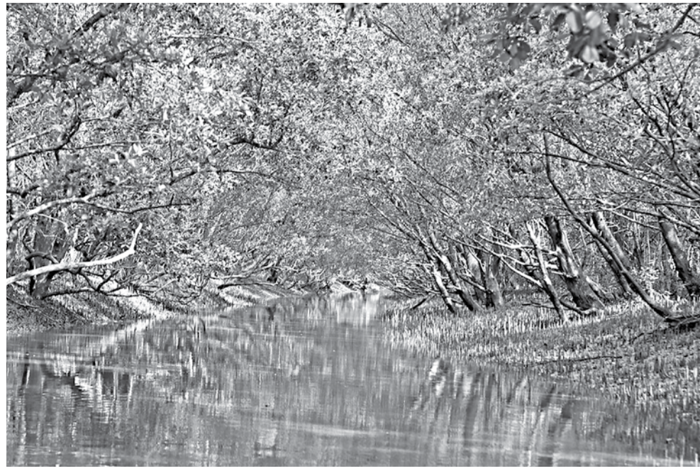
Proper riparian management and restoration of riparian vegetation will not only help prevent river erosion, but will aid in tackling climate change as well.

That being said, the government's current