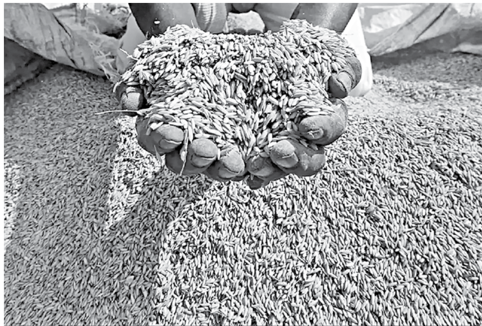
World leaders must focus on ending the corporate capture of food and promoting a transition to agroecology to tackle global hunger.

conflict of interest when it comes to preventing land grabbing, malnutrition, tax avoidance, and pesticide overuse. The same is true of addressing demands for a move away from intensive farming and towards more socially equitable, resilient, and sustainable agroecology. Because these firms are accountable to their shareholders, profit is a more important interest than protection of the common good. But food is a common good, and access to it is a fundamental human right. That is where discussions should begin.