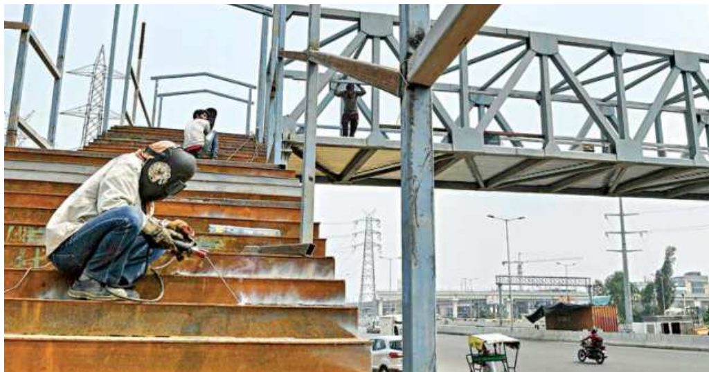
Workers build a bridge in Ghaziabad, India. The Asian Development Bank has cut its growth forecast for developing Asia.

the ADB said. Progress on reducing poverty in developing Asia had been set back "at least two years", and prolonged school closures would lead to higher-than-expected learning and earning losses.