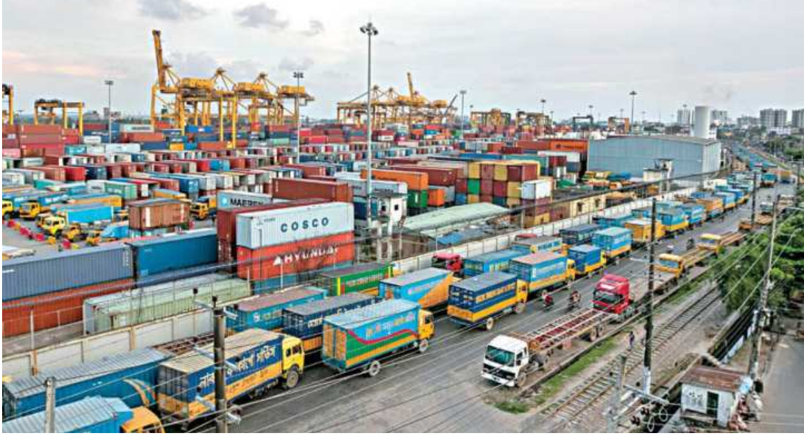
Vehicles transporting goods form a queue to enter the Chattogram sea port after around 35 hours, with a countrywide work abstinence enforced by a section of logistics service providers being called off yesterday afternoon. The photo was taken at Dakkhin Halishahar.

service providers being called off yesterday afternoon. But the strike disrupted the port's recent developments in reducing vessels' waiting periods since August 8 following an acute container congestion in late July. Bangladesh Covered-Van, Truck, Prime Mover Goods Transportation Owners Association and Bangladesh Truck Drivers Workers Federation jointly enforced the countrywide work abstinence. It aimed to realise a 15-point