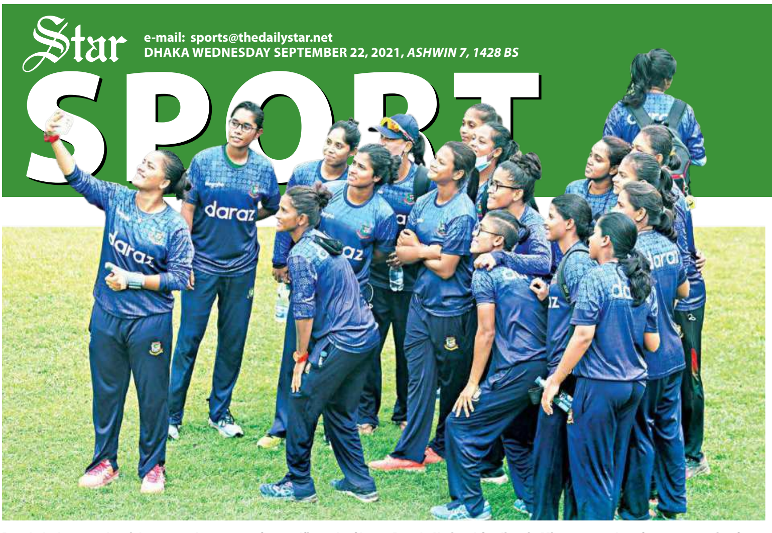
Bangladesh women's cricket team players pose for a selfie at the Sher-e-Bangla National Stadium in Mirpur yesterday after congregating for four days of training there. The 20-member squad, which will move to Sylhet for two more weeks of training and practice matches following the Dhaka-leg, will take part in ICC Women's World Cup Qualifier in Zimbabwe in November-December.