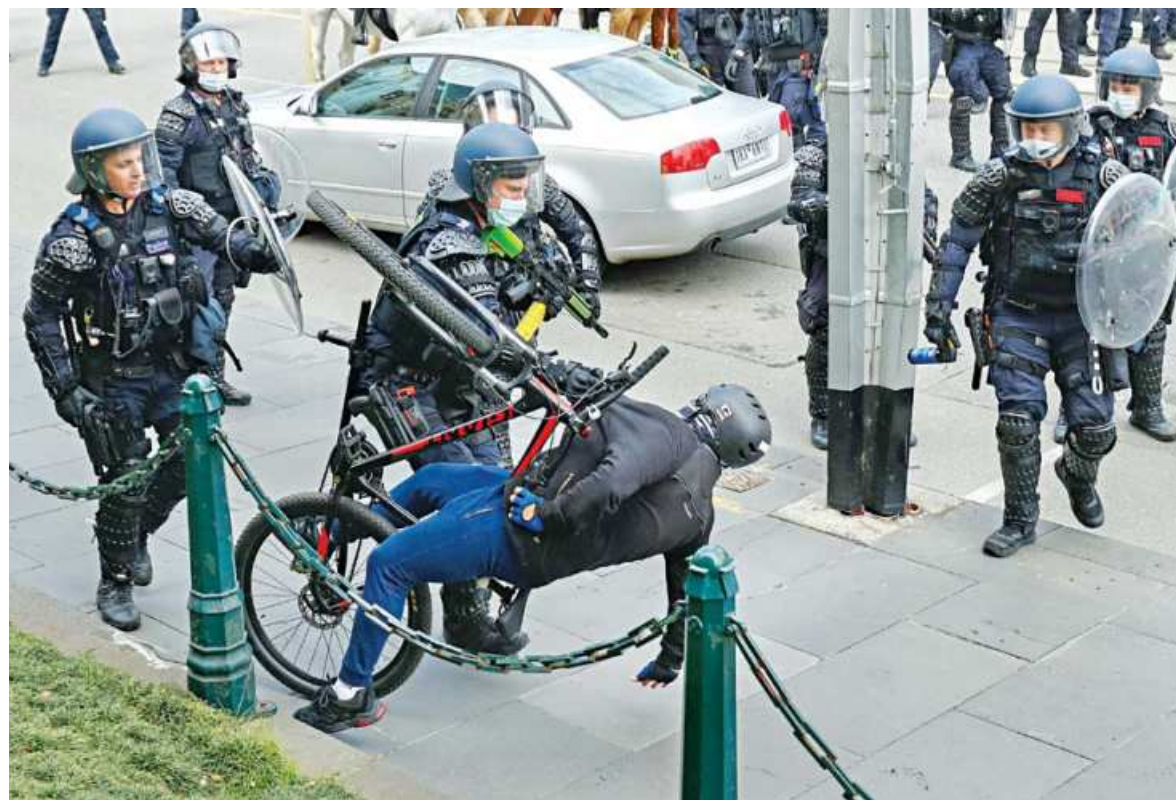
A demonstrator is handled as police officers disperse a protest against Covid-19 regulations in Melbourne, Australia yesterday.

One month after seizing power and pledging a softer version of their previous regime, the Islamists have incrementally stripped away at Afghans' freedoms.