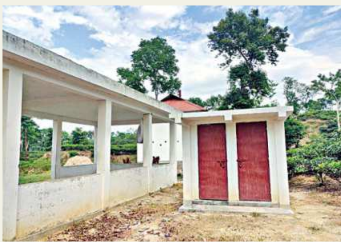
The two toilet facilities for tea garden workers at Mirzapore tea estate in Sreemangal.

According to a survey conducted by this newspaper among 100 female tea garden workers of 10 tea gardens in three districts of Sylhet division, it was found that 80 percent of them work at least eight hours a day; 60 percent urinate at least three times during work out in the open; 80 percent relieve themselves daily during work in the open and 10 percent use soap for cleaning, even though this is crucial amid the pandemic, while 70 percent use sand.