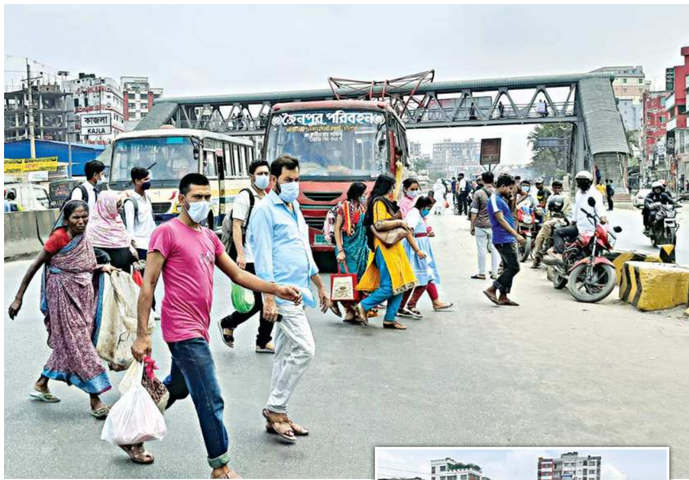
Right in front of Mayor Mohammed Hanif Flyover at Jatrabari's Kazla, part of a road divider had been removed to temporarily facilitate road crossing for pedestrians, as the area didn't have a foot overbridge. However, even after the overbridge was built recently, the divider is yet to be closed, and people are still crossing the busy Dhaka-Chattogram highway the same way rather than using the footbridge only a few yards away. The photos were taken yesterday.