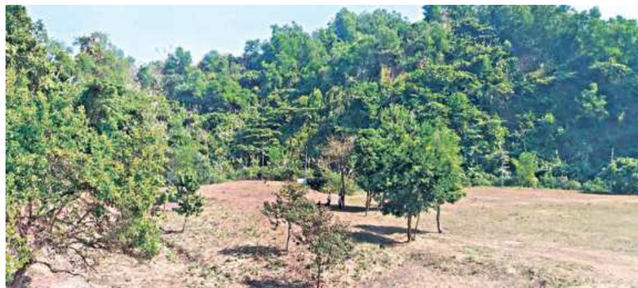
Establishments constructed in the area so far include the five-storey dormitory -- that CVASU said is for "research" -- and two tin-shed hatcheries, while hills were levelled around a hundred yards to the west.