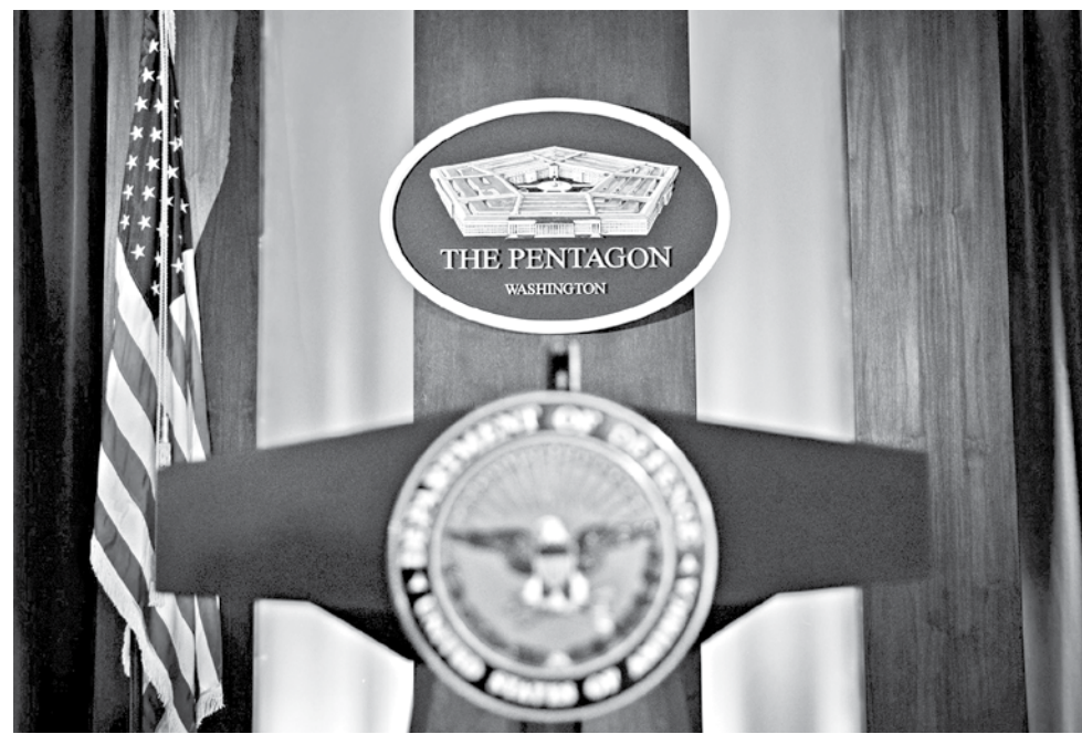
In the long run, peace activism is essential to overcome militarism and stop warfare.

It's vital for progressive activists be clear about what our goals are, and to be willing to challenge even our friends in Capitol Hill.