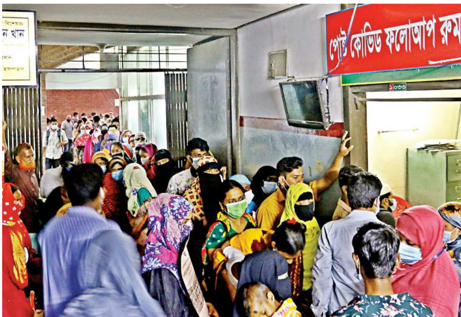
A jam-packed hall in front of a room marked post-Covid followup in Shaheed Suhrawardy Medical College hospital yesterday. Doctors said the number of Covid-19 patients have fallen significantly, but about 300-400 people recovering from the disease through the hospital for post-Covid issues every day.