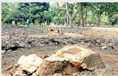
The article 18A of the constitution and the spirit of the 2009 High Court verdict must be maintained in implementing the construction project.

Following another petition, the HC on July 7, 2009 directed the government to identify and preserve all the important historic places related to the republic's Liberation War and to set up memorial monuments at the historic places at Suhrawardy Udyan, maintaining international standard so that people from