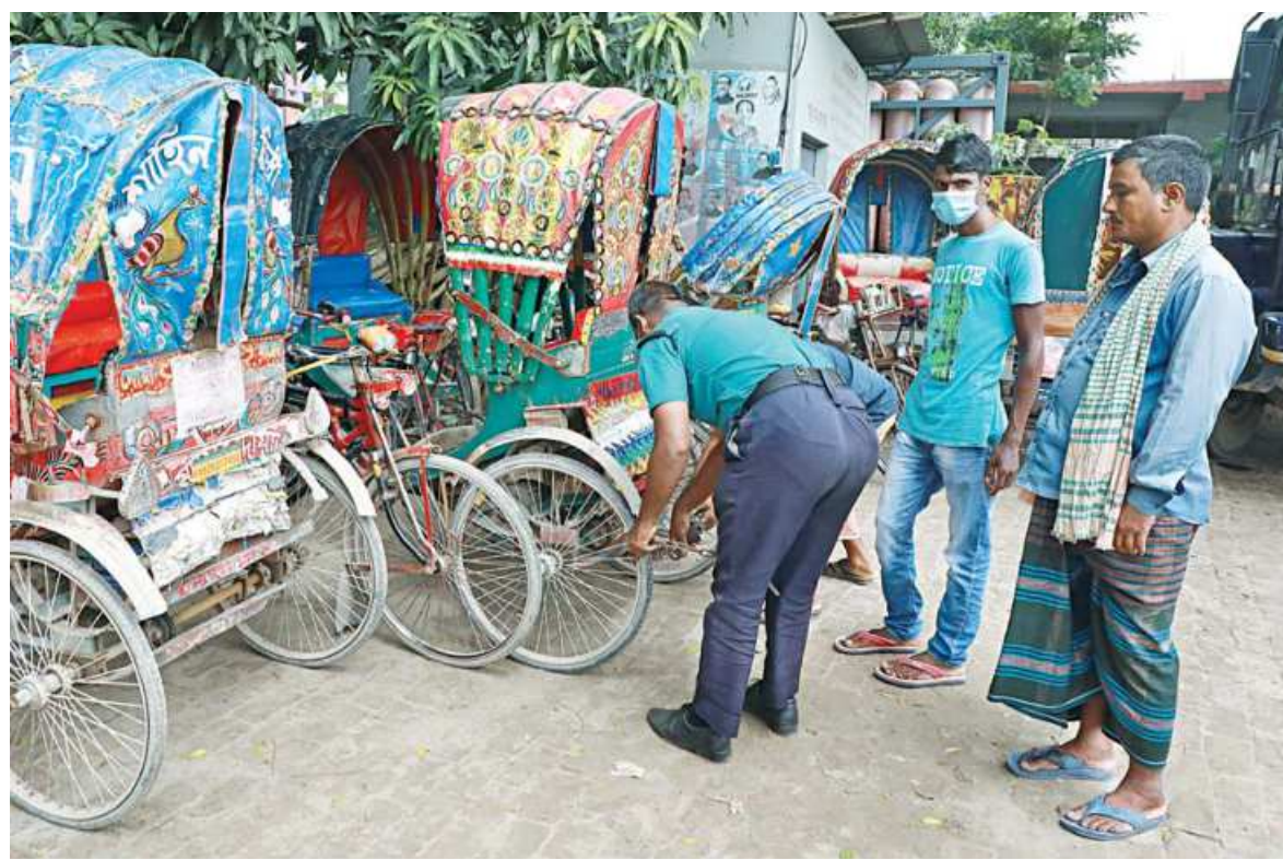
A policeman putting a lock on a battery-powered rickshaw for using the Dhaka-Chattogram highway in the capital's Matua area. Witnesses said police let the rickshaws go after realising a certain amount of fines. Initiatives to keep such three-wheelers off the highways have borne little fruit.