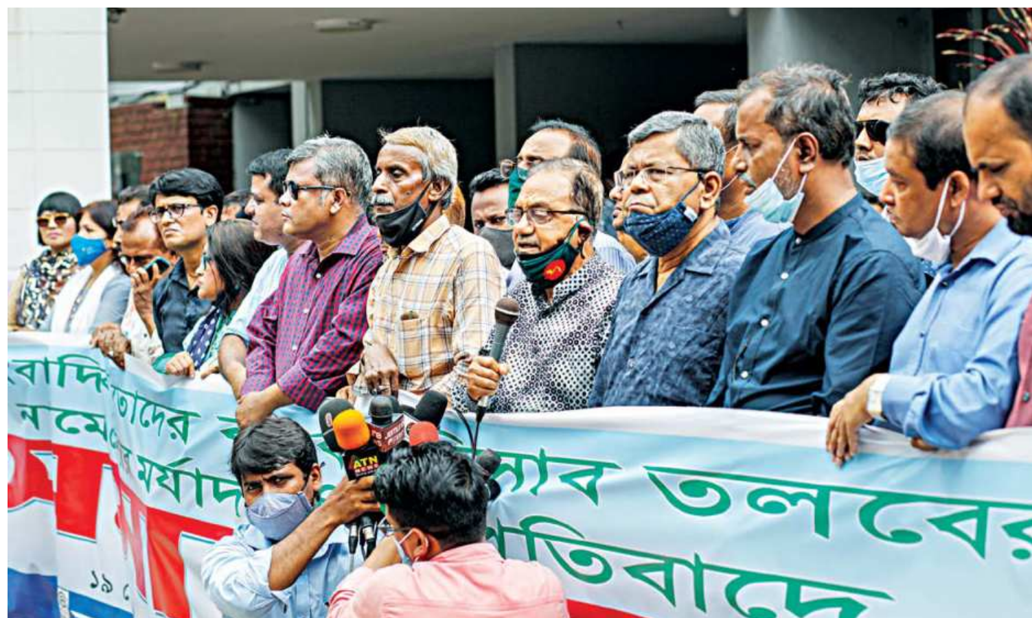
Journalist associations held a rally in front of Jatiya Press Club yesterday, protesting the move of seeking bank account details of 11 journalist leaders by Bangladesh Financial Intelligence Unit.