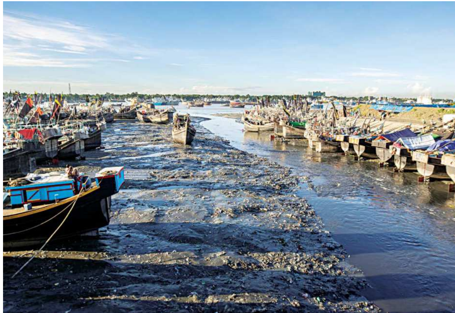
Garbage and industrial waste make Chaktai Khal (canal) look like a stream of filth. Land grabbing and siltation choke this and other canals in Chattogram, resulting in waterlogging in the port city. The canals were once used for transporting goods. Now, boats can ply only during high tides. This photo was taken from Chaktai Khal at Fisherighat on Saturday.