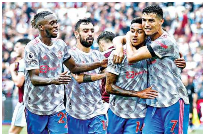
After overturning a 1-0 deficit against West Ham United at the London Stadium, courtesy of a 35th-minute strike from Cristiano Ronaldo and Jesse Lingard's 89th-minute strike, Manchester United still needed goalkeeper David de Gea's stoppage time heroics to keep out a penalty and ensure three points.

Manchester United are second in the Premier League standings with 13 points from five games while West Ham have eight after suffering their first defeat of the season.