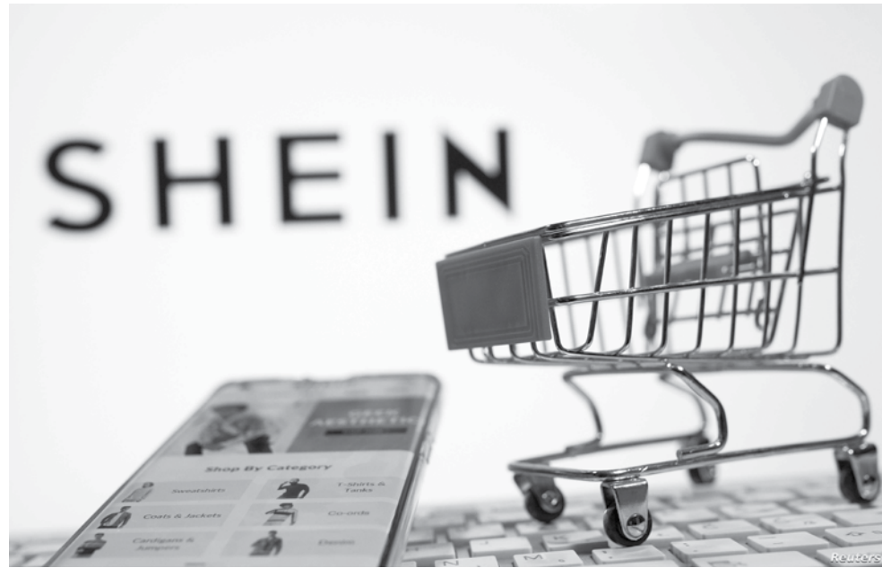
Online fashion retail is one area where regulators appear to be failing to keep pace with its rapid development.

The advent of online buying has opened up the fashion industry to many smaller, online-only sellers who are able to evade compliance rules.