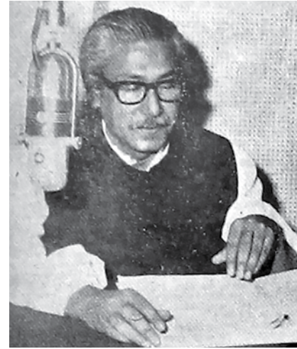
Bangabandhu addressing the nation over radio on March 26, 1972.

once did and, motivated by compassion, would relent and release the wrongdoer. This human quality was exploited by the people and eventually led to the final acts of betrayal by some of those whom he trusted despite evidence to the contrary. This not only cost him his own life but that of so many he held so dear." [pg. 305]