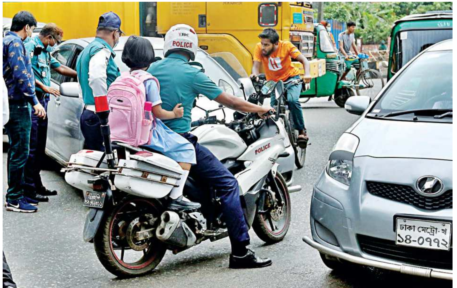
Moments after a serious tragedy was averted in front of Suhrawardy hospital: The traffic sergeant taking apparently his daughter to school on the motorcycle was riding on the wrong side of the road when the car, making a legal U-turn, managed to stop inches away from the bike. Nevertheless, traffic cops present in the vicinity penalised the car driver. The traffic sergeant's bike is not even registered. It just says "DMP E.N: 364311" on the number plate.