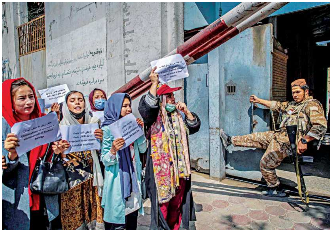
A Taliban fighter watches as Afghan women hold placards during a demonstration demanding better rights for women in front of the former ministry of women affairs in Kabul yesterday.