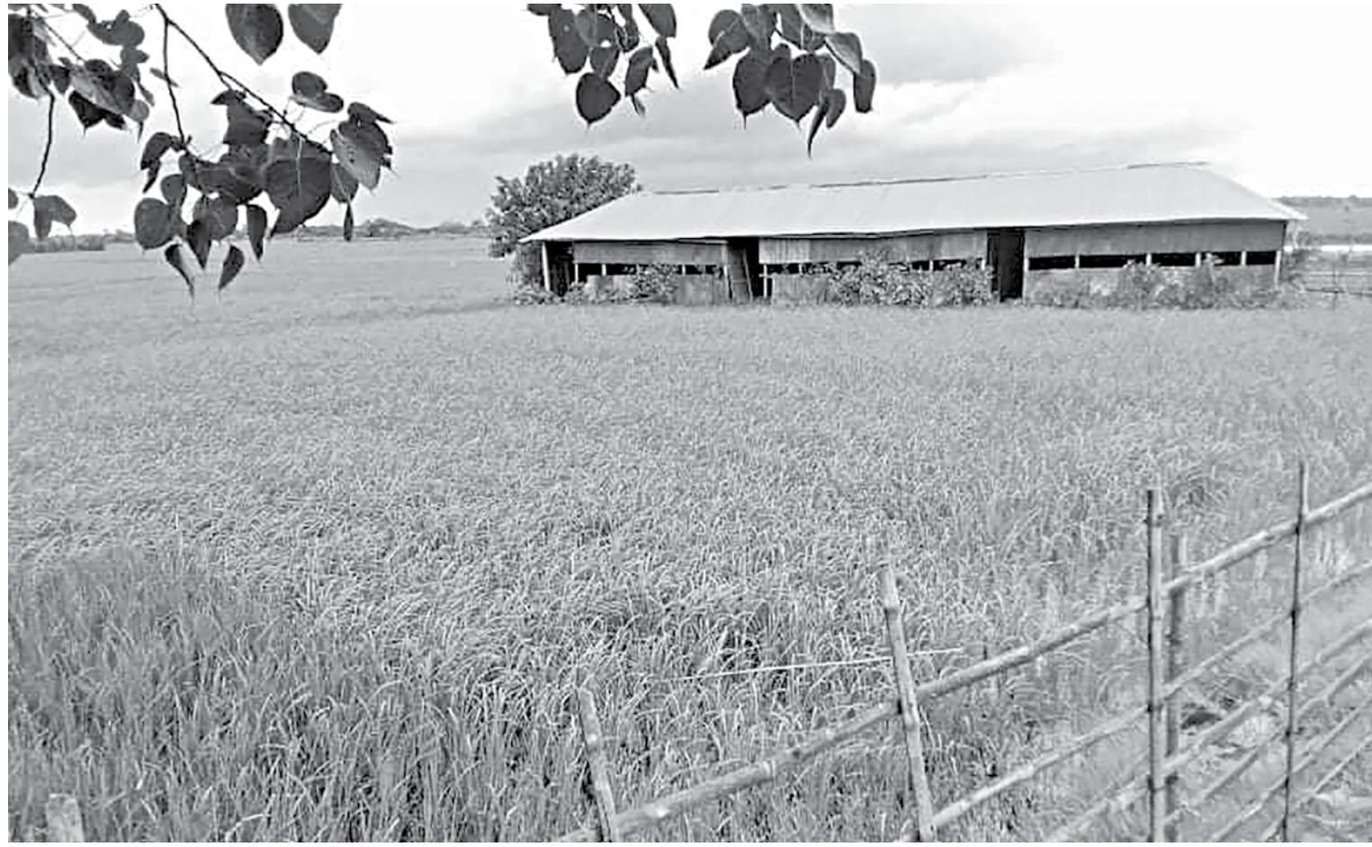
Ramnagar Poshchimpara Primary School in Kushtia's Mirpur upazila could not be reopened after Covid-19 restrictions were lifted recently, as rice cultivation in its playground has made the school inaccessible for all.