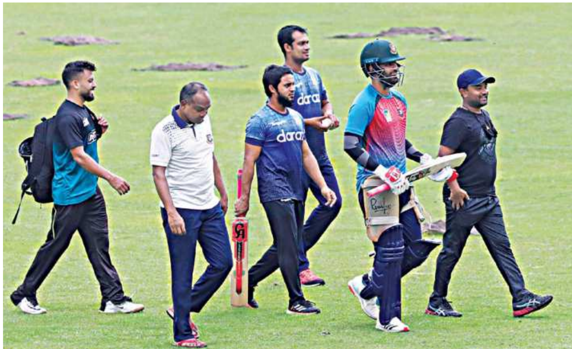
Bangladesh cricket's three stalwarts train yesterday, each with different mission in mind. Bangladesh ODI captain Tamim Iqbal returns to training in Mirpur following two months of recovery from injury. The left-hander is set to feature in a T20 franchise tournament in Nepal, starting next week. Bangladesh's ace all-rounder Shakib Al Hasan and West Indies' star spinner Sunil Narine show thumbs-up at the training session of Kolkata Knight Riders, ahead of their opening match of the second phase of the Indian Premier League against Royal Challengers Bangalore today. Mushfiqur Rahim characteristically began training earlier than everyone else even though the national cricketers are currently enjoying an extended break ahead of their camp in Oman next month for the upcoming T20 World Cup.