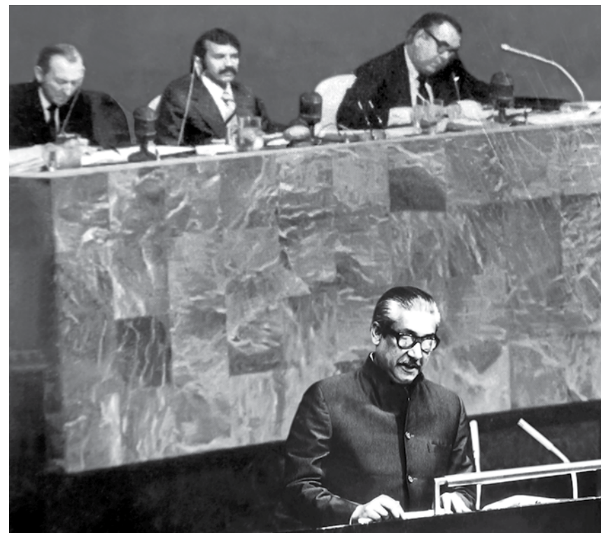
Bangabandhu addressing the 29th Session of the UNGA on September 25, 1974

When Bangabandhu had visited China and seen the excellent system of managing one of the largest textile mills in Asia with his own eyes in 1956, he decided (as stated in his accounts) that he would follow socialist principles. Later on, he became an influential proponent against monopoly ownership of the 22 affluent families of Pakistan. He also openly promised to establish an exploitation-free egalitarian society in East Bengal. He even pledged on several occasions to ensure fair income share for the workers and farmers, stopping all kinds of unearned income opportunities, arranging universal education and