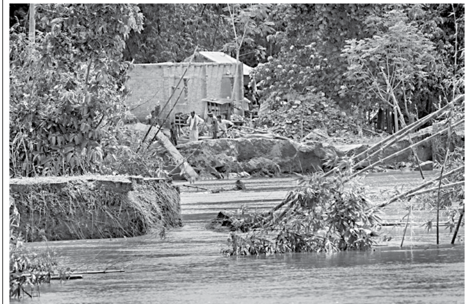
Over 100 families have been rendered homeless by the Padma river's erosion at Goadubi village under Sadar upazila of Chapainawabganj in last three weeks.

They were dumping sand-filled GEO bags along the 670-metre-long stretch on the left bank to protect some establishments, he added.