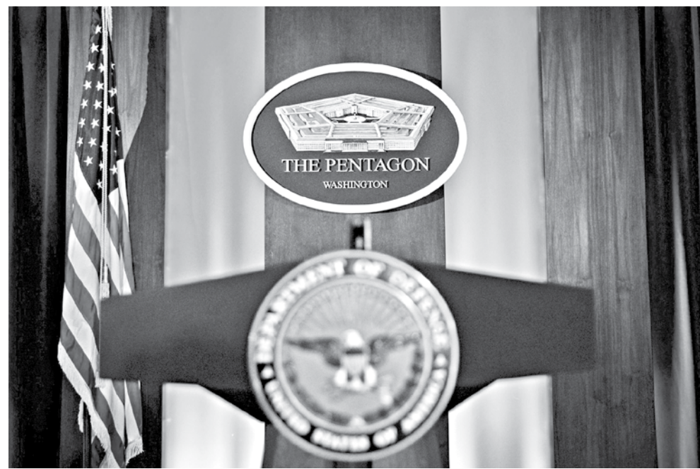
In the long run, peace activism is essential to overcome militarism and stop warfare.

It's vital for progressive activists be clear about what our goals are, and to be willing to challenge even our friends in Capitol Hill.