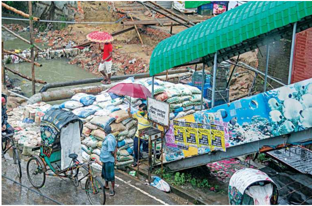
This canal at the port city's Colonel Hat is under development works for the last three months. While that's well and good, its construction materials are kept right in front of a nearby foot overbridge, which is creating difficulties for pedestrians. On the other hand, as the adjacent road has been dug up, people are crossing the canal using a thin, railing-less pipe, which is an extremely risky undertaking, especially during the rainy season. These photos were taken yesterday.