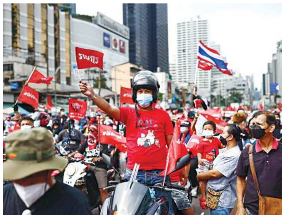
An anti-government protester waves a flag during a demonstration to mark the 15-year anniversary of the 2006 military takeover in Bangkok, Thailand yesterday as they urge the resignation of the current administration over its handling of the coronavirus crisis.

"There will be an exchange on the phone in the coming days," spokesman Gabriel Attal told the BFM news channel, adding that the request for the conversation had come from Biden.