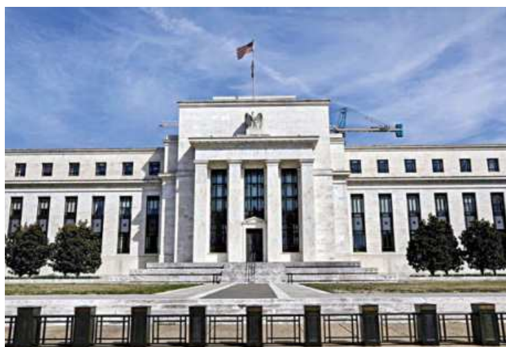
The Federal Reserve Board building on Constitution Avenue is pictured in Washington, US.

In addition to slashing the benchmark lending rate to zero, the Fed began buying