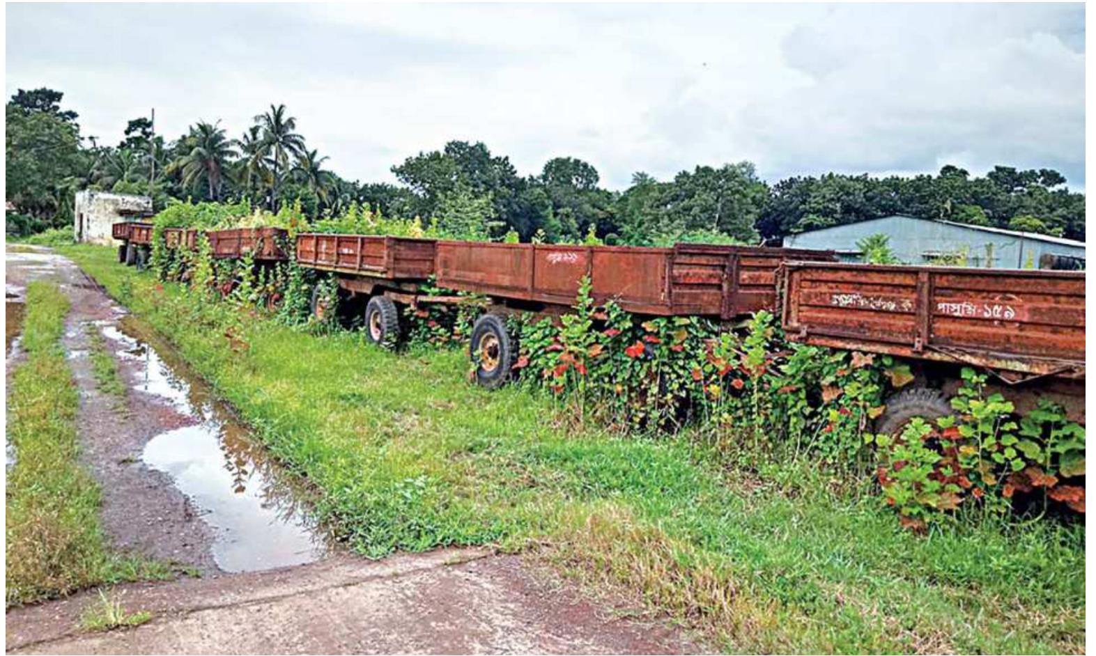
Sugarcane carrying trolleys are seen rusting away on a lot outside the Pabna Sugar Mill in Ishwardi upazila as the sugar processing unit has remained inactive since December last year following a government order. The photo was taken recently.

Many are switching to other crops to make ends meet