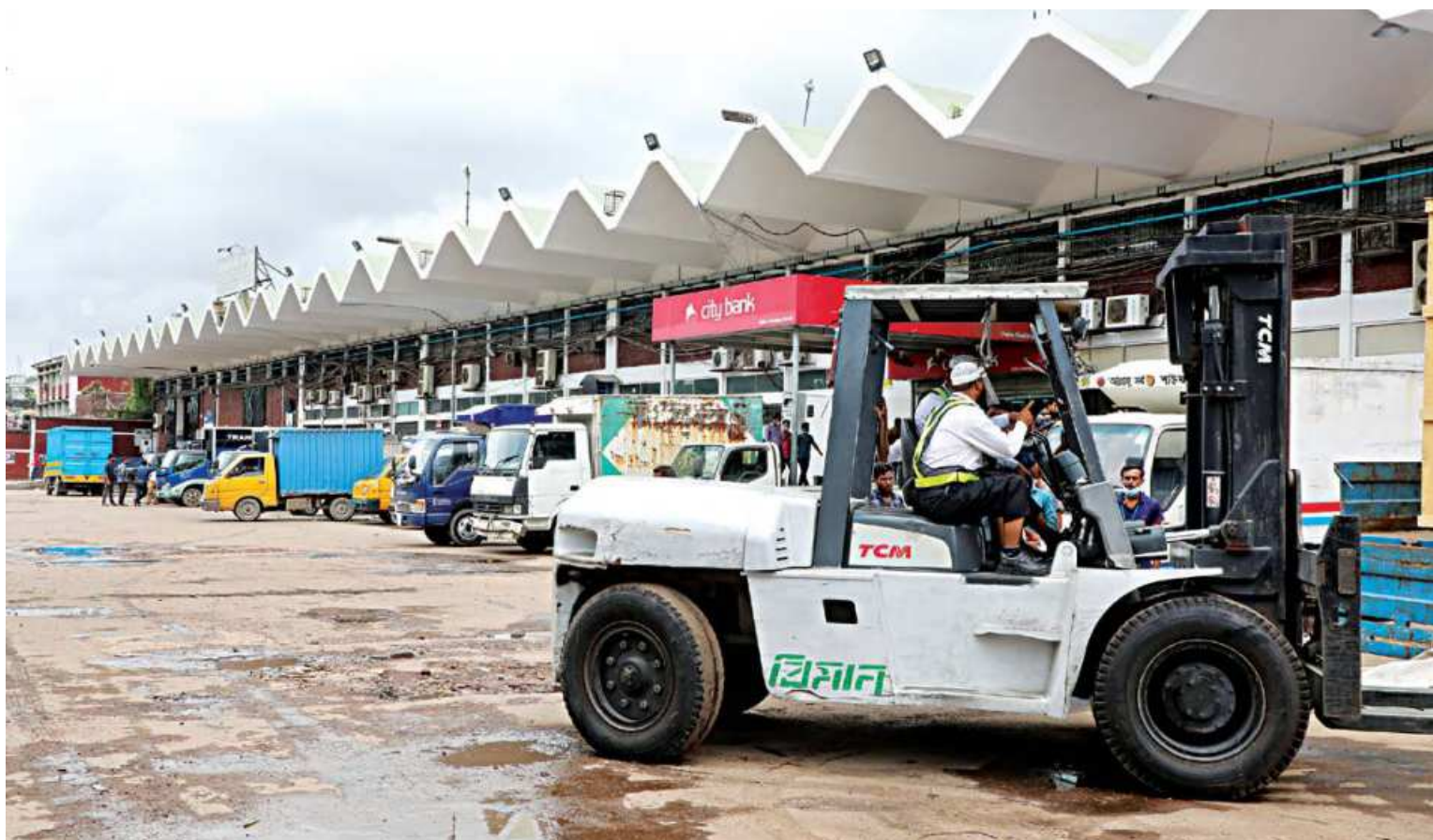
This cargo warehouse of Hazrat Shahjalal International Airport in Dhaka has become overloaded amid allegations that exporters treat it as their own personal space, storing goods without any bookings. The photo was taken yesterday.

DHAKA MONDAY SEPTEMBER 20, 2021, ASHWIN 5, 1428 BS • starbusiness@thedailystar.net