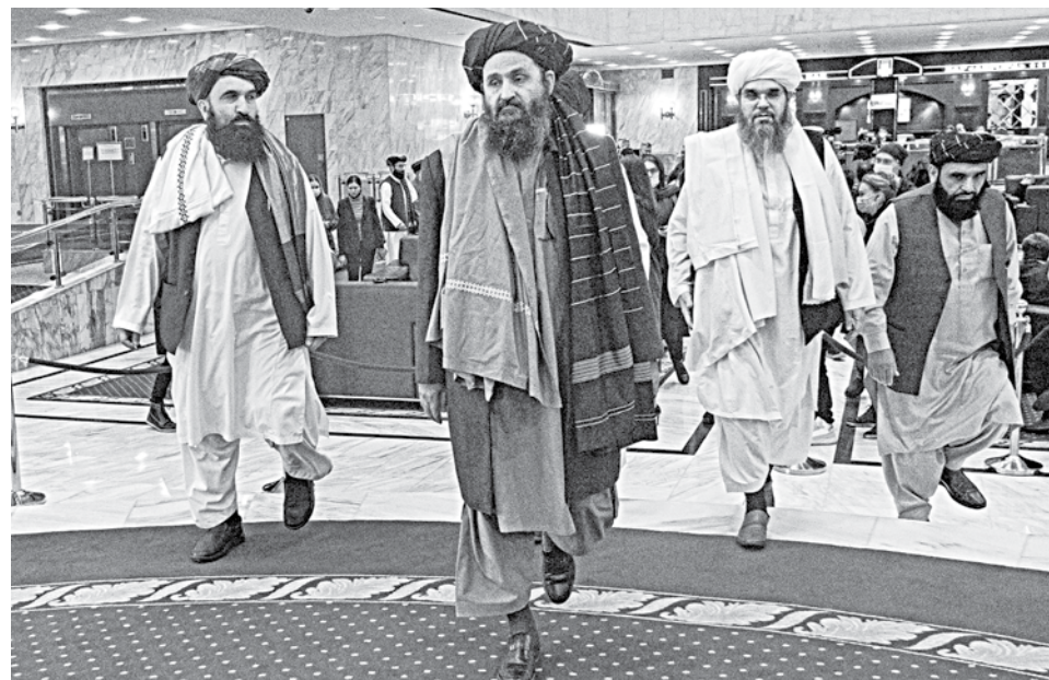
Mullah Abdul Ghani Baradar, the Taliban's deputy leader and negotiator, and other delegation members attend the Afghan peace conference in Moscow, Russia March 18, 2021.

As a result, they are likely to be equally