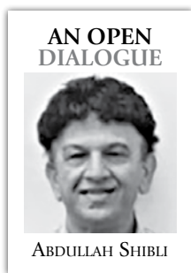
AN OPEN DIALOGUE