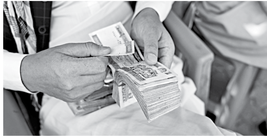
An Afghan man counts his money after the Afghan currency faced devaluation in Kabul, Afghanistan, September 4, 2021.