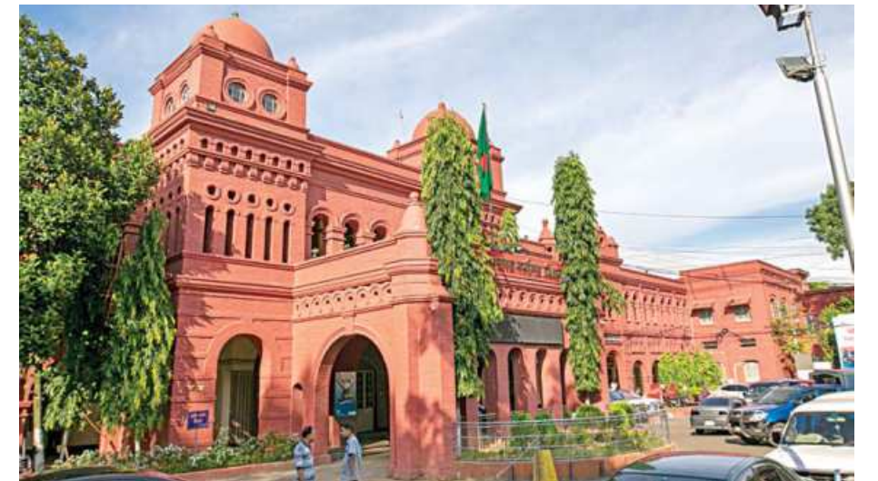
Authorities are planning on declaring the hill -- which houses several courts and buildings for lawyers, among other offices -- as a heritage site. Chattogram District Bar Association, however, wants to build two 12-storey buildings at the area.