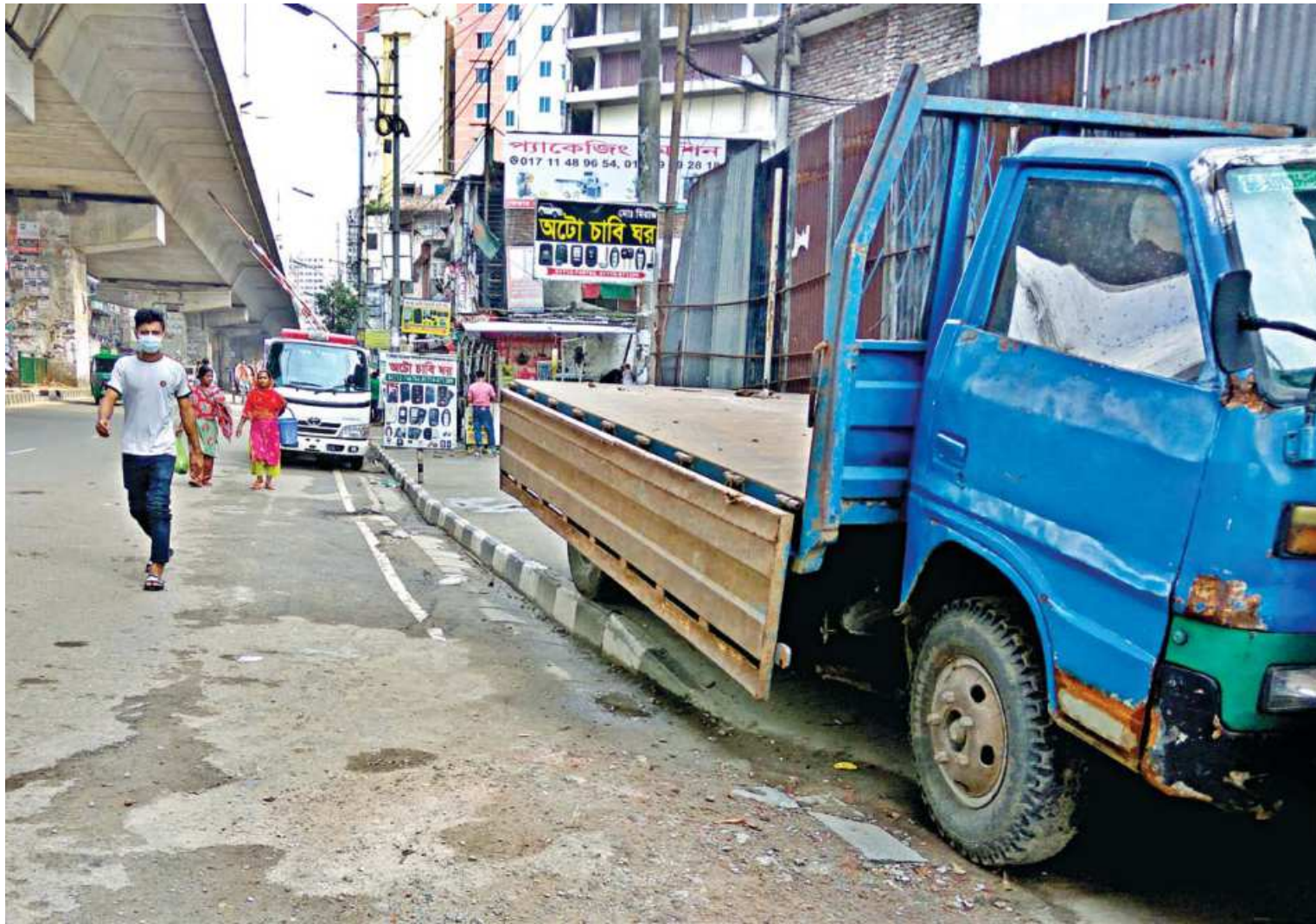
Motorcycles on footpaths is nothing new; a pick-up truck, however, is a whole new level of disregard for traffic rules and pedestrians. The driver of this vehicle did not only steer it over the footpath, but also thought it was completely okay to park it there. This photo was taken yesterday from Tongi Diversion Road at the capital's Moghbazar.