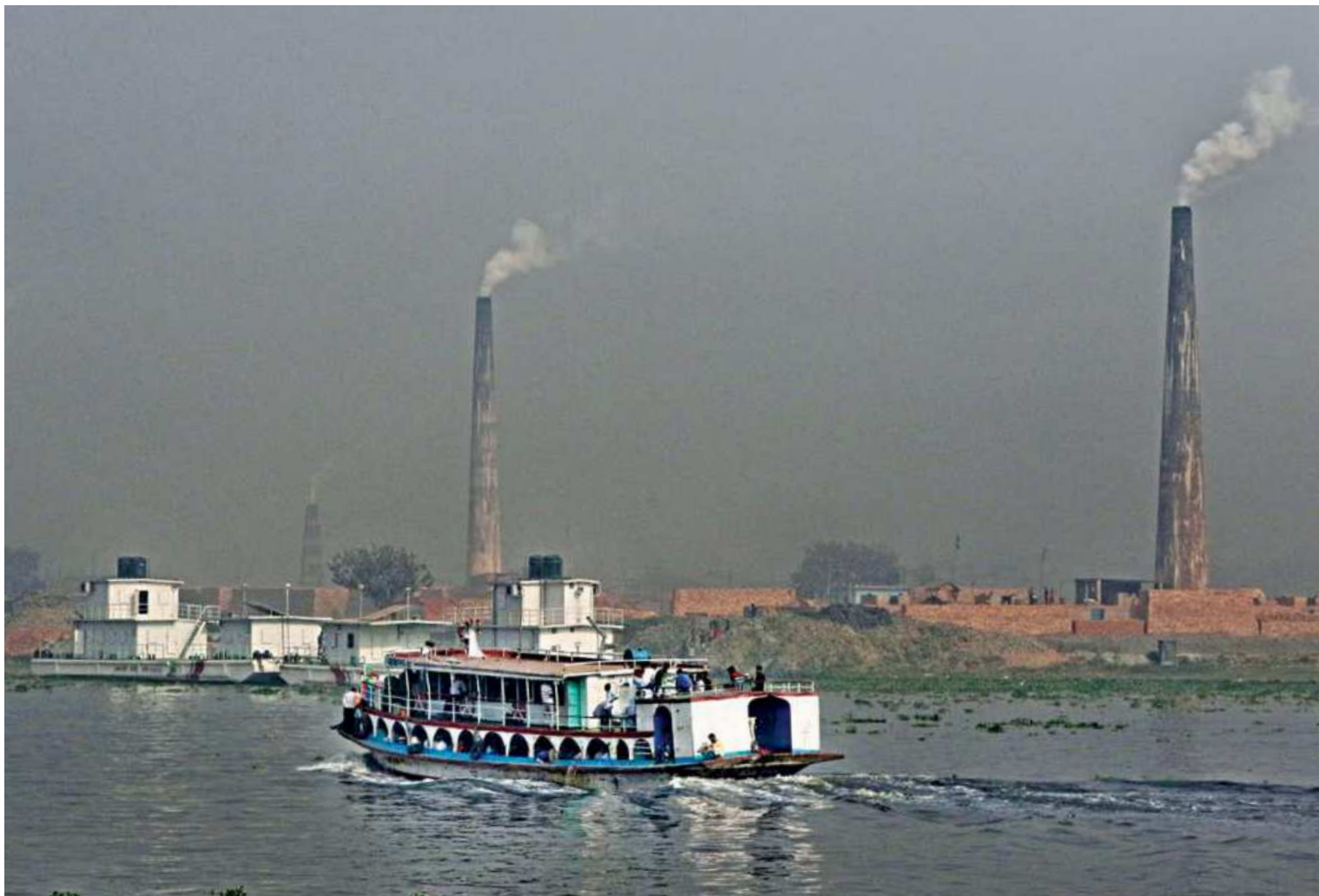
INTO THE SMOG... Smoke emanating from brick kiln chimneys that blemish the skyline at Muktarpur by the Buriganga in Dhaka. The city is considered one of the worst in the world in terms of air quality. There are rules and laws to protect the environment, but they seem to exist mostly on paper.