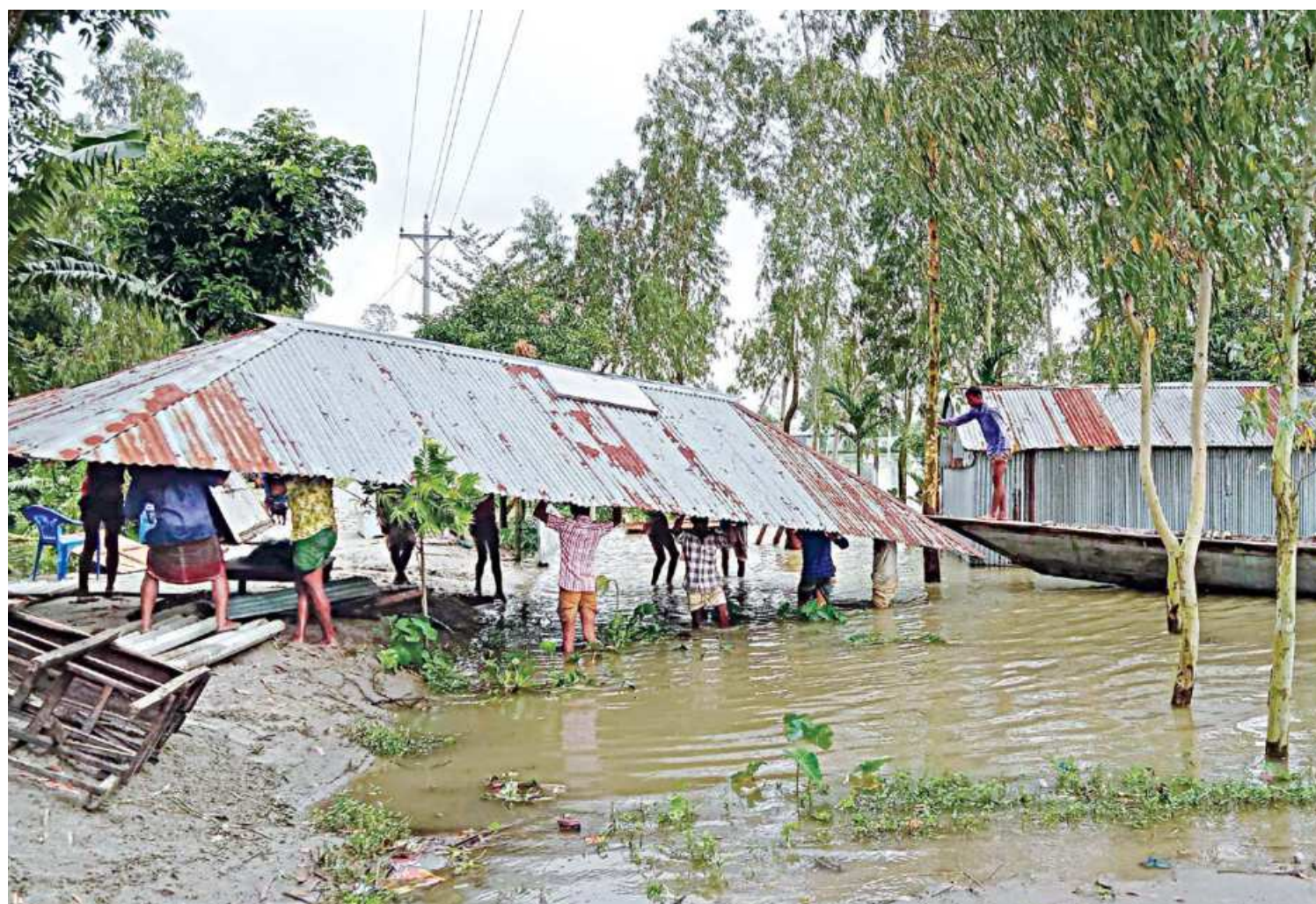
Family members carrying the tin-roof of what was their house to a boat by which they would evacuate Binbina area in Gangachara, Rangpur. A swollen Teesta has been washing away entire neighbourhoods in the region in recent weeks.