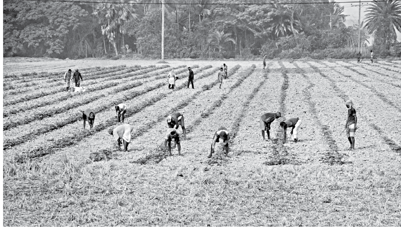
Small farmers are one of the communities most vulnerable to the impacts of climate change in Bangladesh.

Bangladesh has seen a wave of pilot experiments in agricultural insurance over the past decade. We now have the evidence to show that insurance works, it will be accepted by small farmers, and can be fine-tuned to protect against major weather risks. Brac and Islamic Relief are providing insurance against livestock deaths. Sadharan Bima Corporation (SBC), Green Delta Insurance Company Ltd, and Pragati Insurance Ltd have joined forces with Oxfam, World Food Programme (WFP), and Swiss Re to pilot-test weather index-based crop insurance (WIBCI). The SBC, Oxfam and the International Water Management Institute recently collaborated with the Sacred Heart Foundation, a local NGO in the country's haor area, to provide WIBCI for smallholders in this highly vulnerable region. Over 600 small farmers were recently delighted to receive payments when flash floods