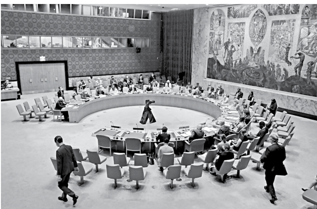
The United Nations Security Council meets to discuss the situation in Afghanistan at the UN Headquarters in New York, US.