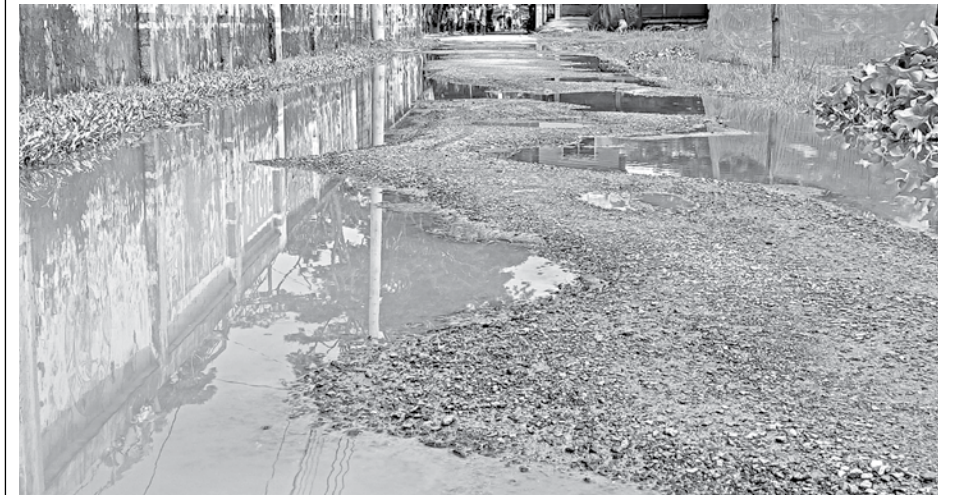
Part of a dilapidated road in Patuakhali's Kalapara town. The photo was taken recently.

However, work was underway to repair some of the roads and the townspeople would get relief from the sufferings once all the roads are repaired after the monsoon.