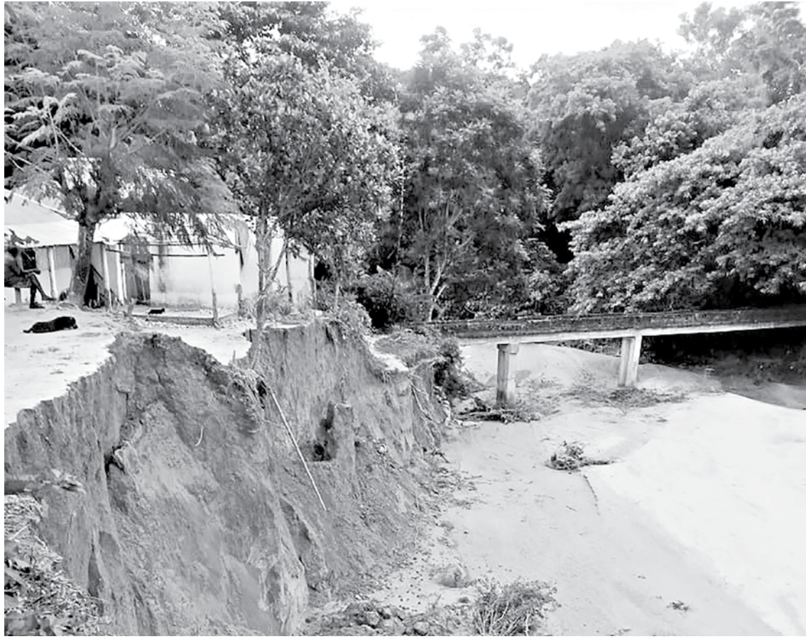
A house on the verge of collapse near the landslide site of a hillock at Satchhari Tripura village in Chunarughat upazila of Habiganj.

The villagers said they witnessed a massive landslide following a few days of incessant rain last year and they were wary of a catastrophe any time.