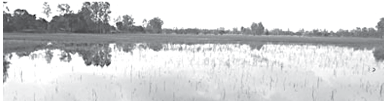
About six hundred bighas of Aman paddy have remained under water at Kaldaspara village in Tentulia upazila of Panchagarh as a local influential person has built a poultry shed blocking the waterflow through a culvert.