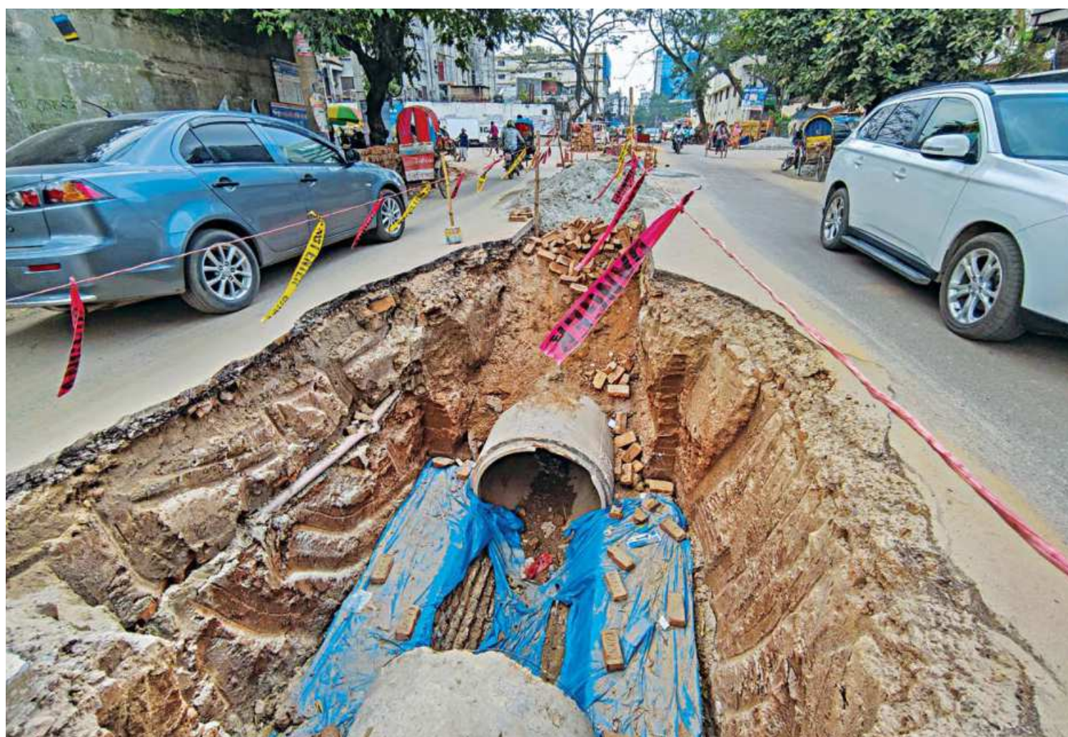
Without placing proper barriers, a large hole is dug right in the middle of a street near the capital's Tejgaon. Dhaka North City Corporation has dug such holes in several streets in Tejgaon for the installation of drainage pipes. Sometimes rainwater accumulates in these holes making it hard for motorists to realise the risk. The photo was taken yesterday.