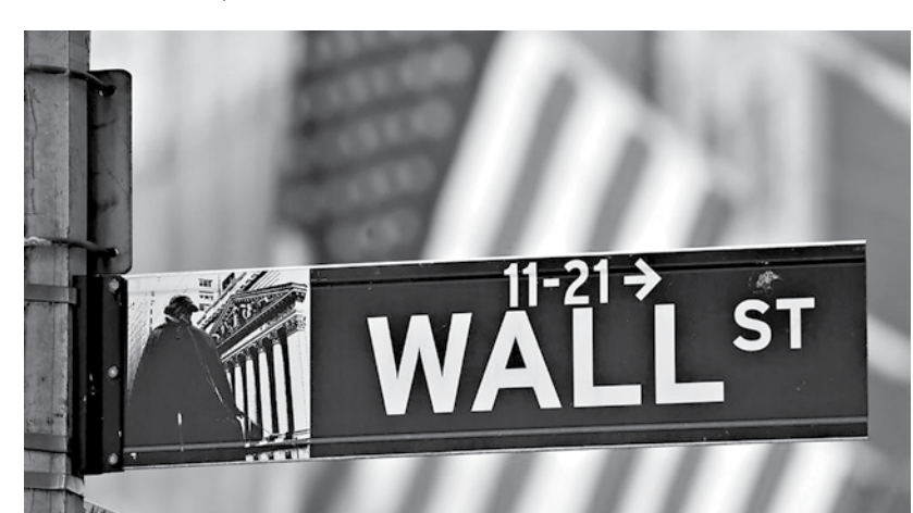
A street sign for Wall Street is seen outside the New York Stock Exchange in New York City on July 19.

both of which are due at 8:30 AM ET Beijing's regulatory overhaul of (1230 GMT). S&P 500 E-minis were down 5.75 points, or 0.13 per cent at 06:22 am ET. Dow E-minis were down 28 points, or 0.08 per cent, while Nasdaq 100 E-minis were down 32.75 points, or 0.21 per cent.