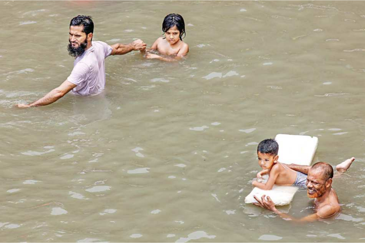
Despite the rainfall of the last few days, the mercury picks right back up as the drizzles subside. To find respite, a few families got down into the Buriganga to swim around and teach their children the way of the water. This photo was taken recently from Basila bridge area near Mohammadpur.