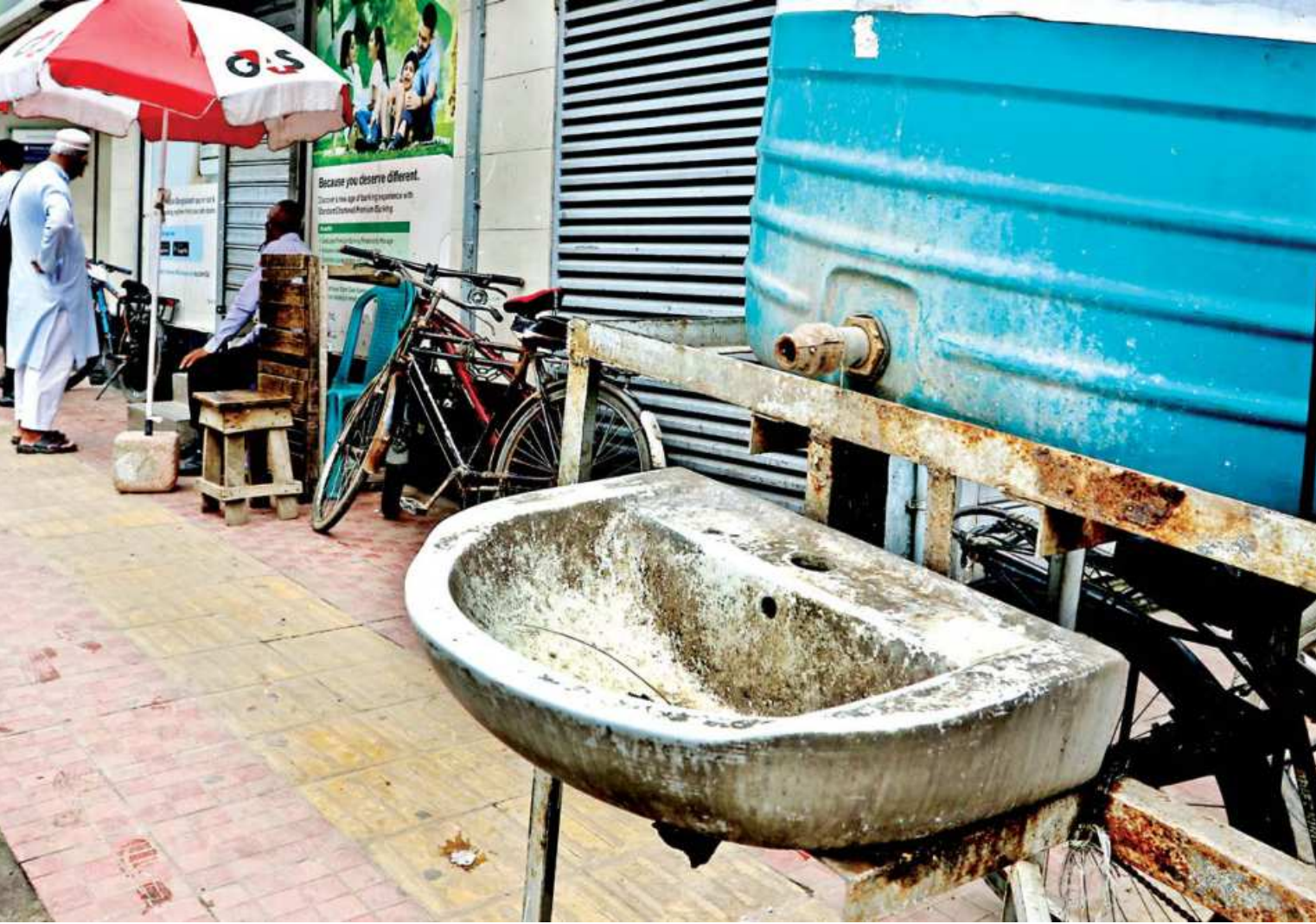
To help the capital's residents resist the coronavirus, Dhaka Wasa took an initiative of placing several hand washing facilities across various locations of the city. Only that most of them are lying out of order, with no water in the tanks and even the taps missing. This photo was taken yesterday from Kazi Nazrul Islam Avenue near Karwan Bazar.