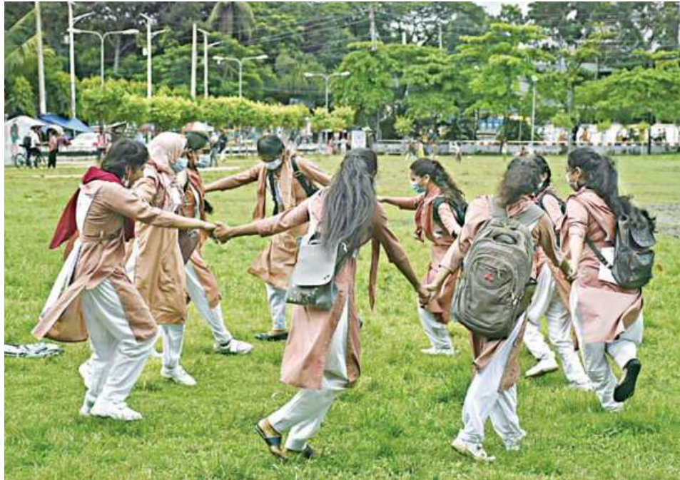
After nearly 18 months of separation caused by closure of educational institutions amid the Covid-19 pandemic, a group of SSC candidates of Barishal Model School and College celebrate the reunion with old friends. The photo was taken at a field next to the school yesterday.