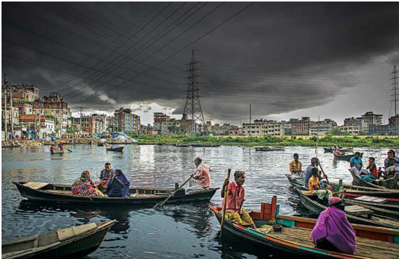
UNDER A CLOUD CANOPY... Boatmen on the bank of the Buriganga waiting for potential passengers under a sky darkened by heavy clouds. It had been drizzling since morning yesterday, and passengers to take to the other side of the river were few and far between. The photo was taken from the capital's Kamrangirchar.