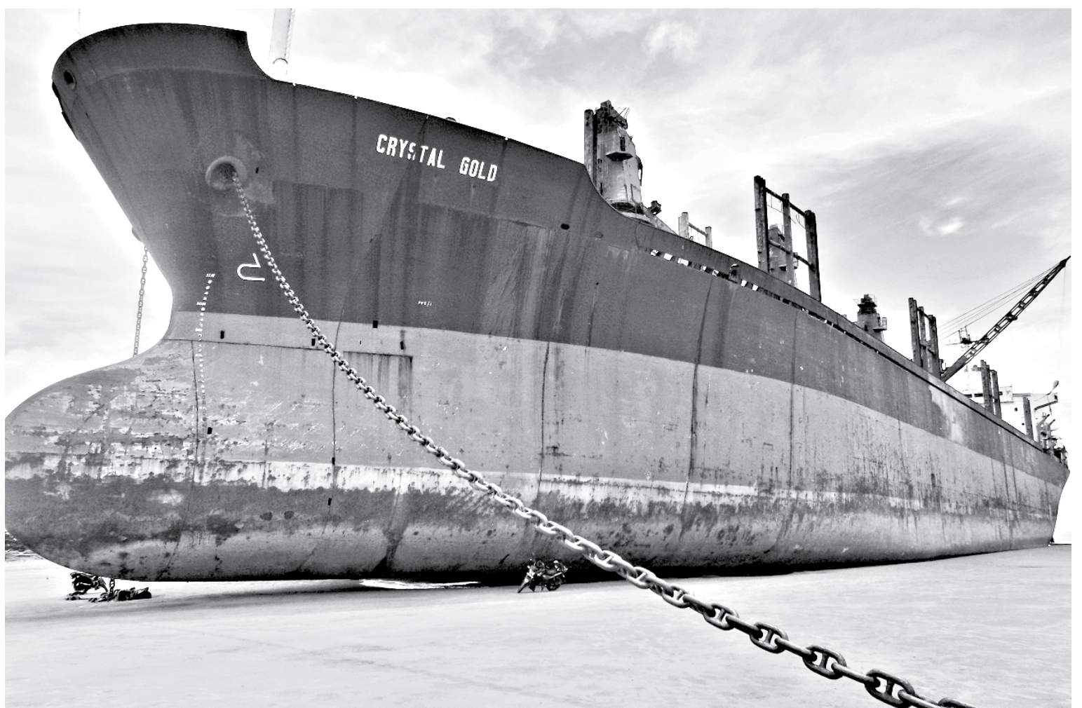
Crystal Gold's stay at the beach has been long and unwelcome. In its four years here, it has generated so much silt that the nearby "char" and Jhau forest have been massively damaged. Meanwhile contaminants leaking from it are threatening the area's ecosystem. These photos were taken recently.