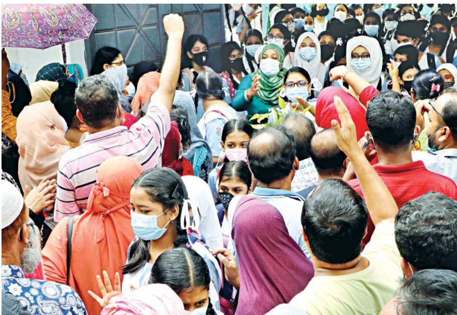
Students getting out of Viqarunnisa Noon School and College on the capital's Bailey Road through a crowd of guardians waiting to receive them after the end of school hours yesterday. Such gathering of guardians at the school gate makes it impossible for the school authorities to maintain physical distancing which was one of the main conditions for the recent reopening of the educational institutions after a closure of 18 months.