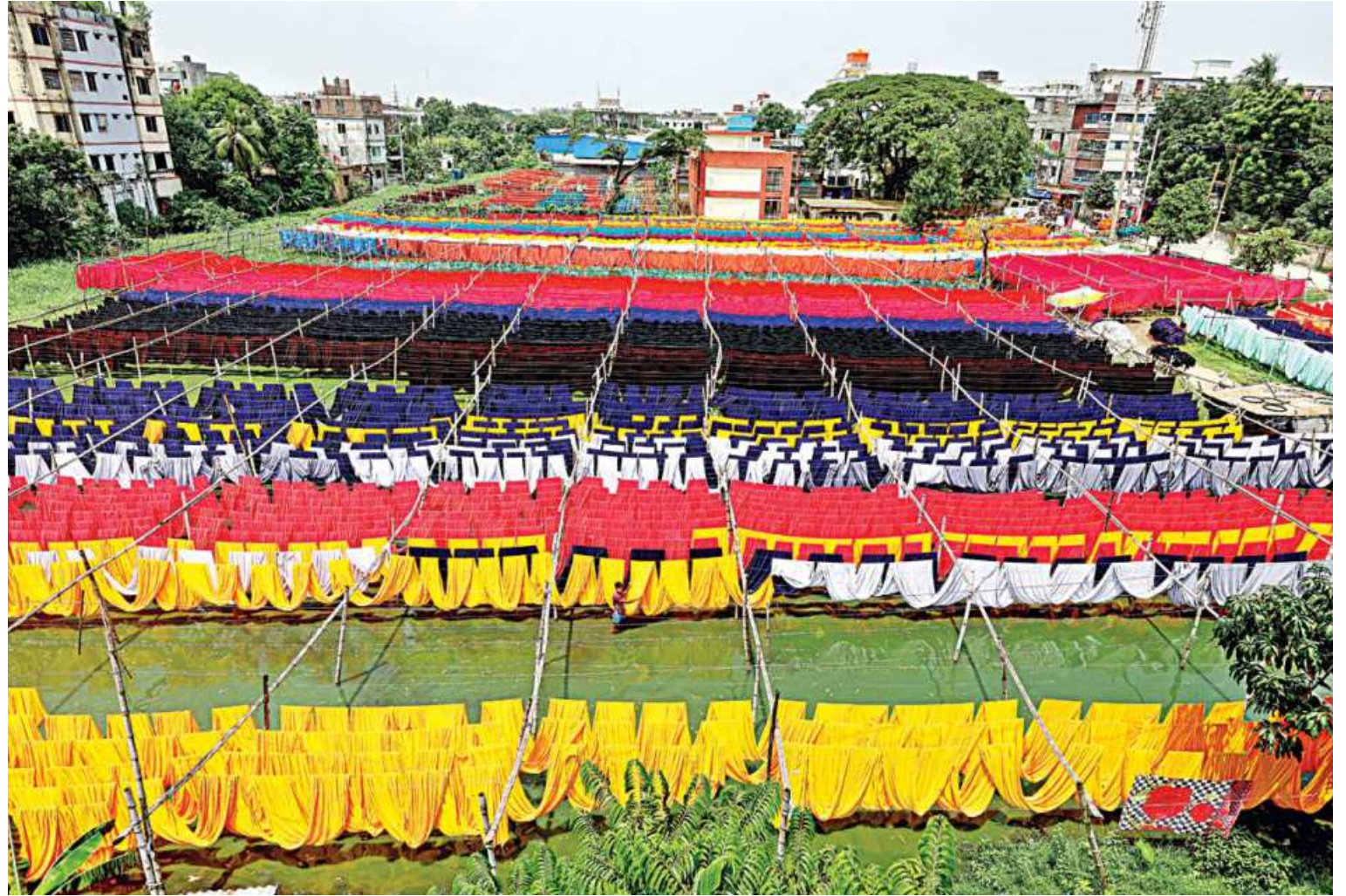
Dyed pieces of cloth left in the sun to dry at a dyeing factory in Narayanganj's Hajiganj area. The local dyeing industry continues to recover from losses as garment work orders pick up with improvement in the Covid-19 situation. With much less work orders, such colourful scenes at the factories were rare even a few months ago. The photo was taken recently.