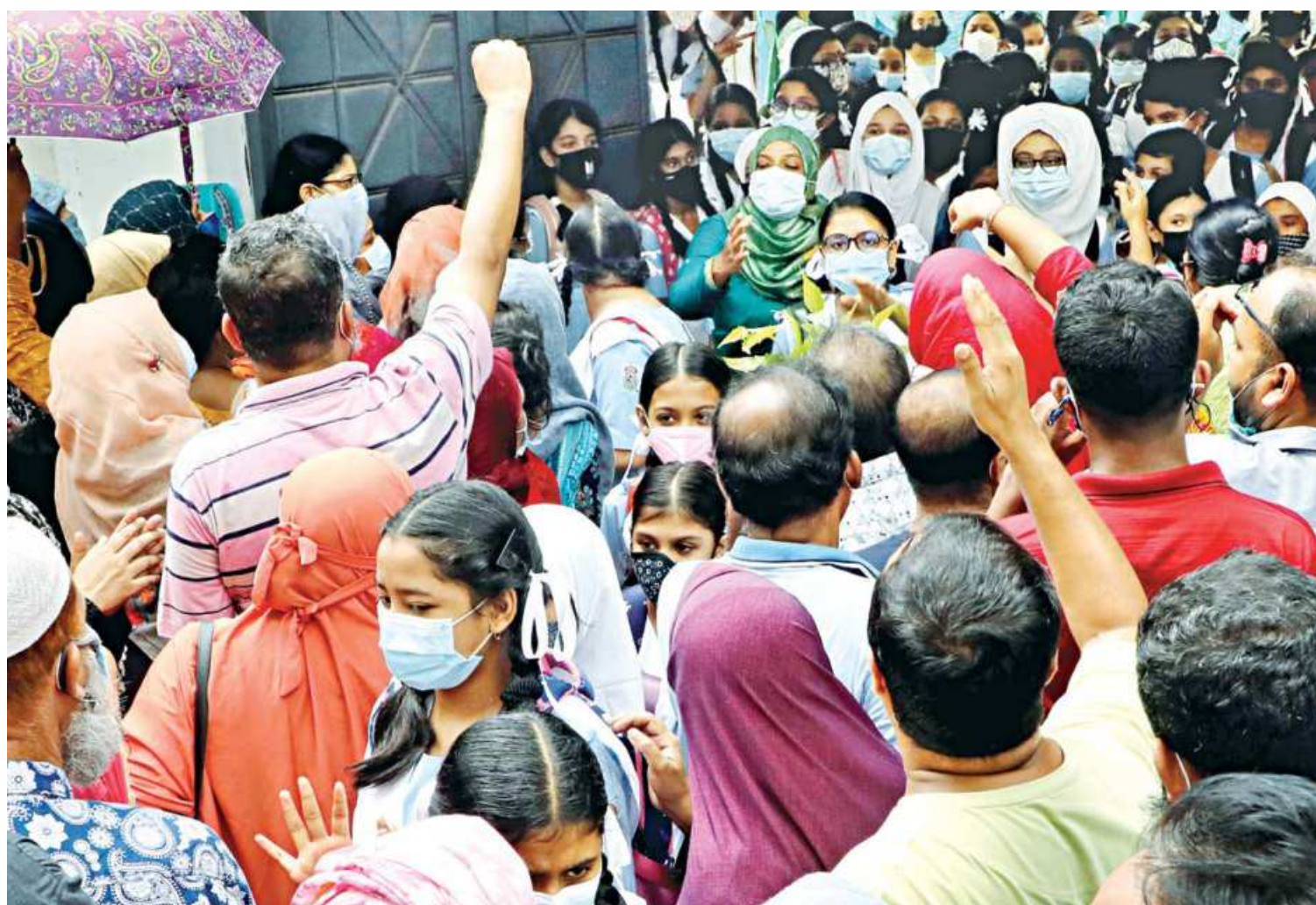
Students getting out of Viqarunnisa Noon School and College on the capital's Bailey Road through a crowd of guardians waiting to receive them after the end of school hours yesterday. Such gathering of guardians at the school gate makes it impossible for the school authorities to maintain physical distancing which was one of the main conditions for the recent reopening of the educational institutions after a closure of 18 months.