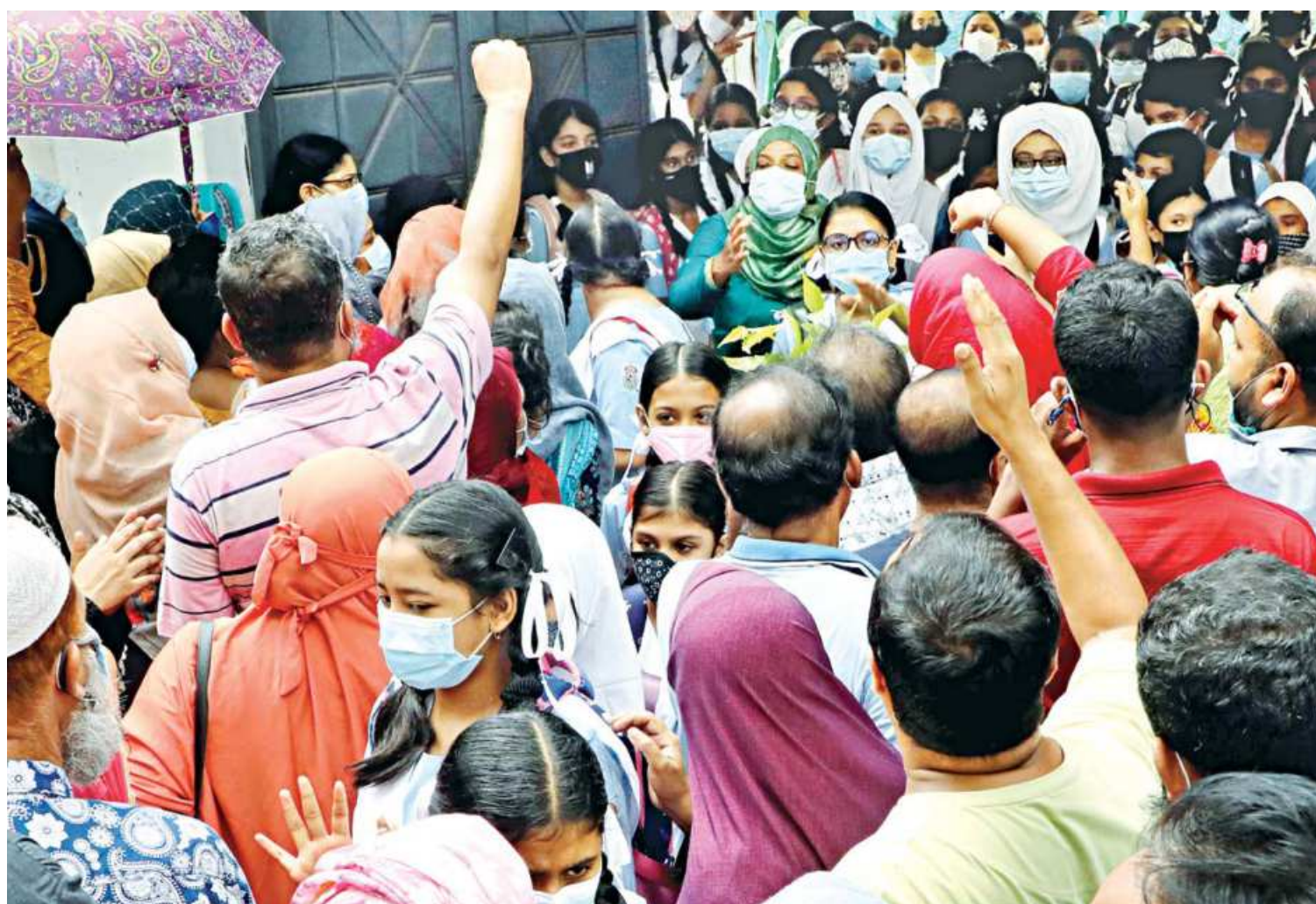
Students getting out of Viqarunnisa Noon School and College on the capital's Bailey Road through a crowd of guardians waiting to receive them after the end of school hours yesterday. Such gathering of guardians at the school gate makes it impossible for the school authorities to maintain physical distancing which was one of the main conditions for the recent reopening of the educational institutions after a closure of 18 months.