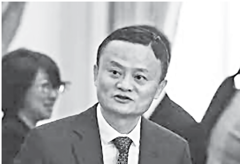
Alibaba Group founder Jack Ma

"It wants to end that. Alipay's parent company Ant Group is China's biggest payments services provider.