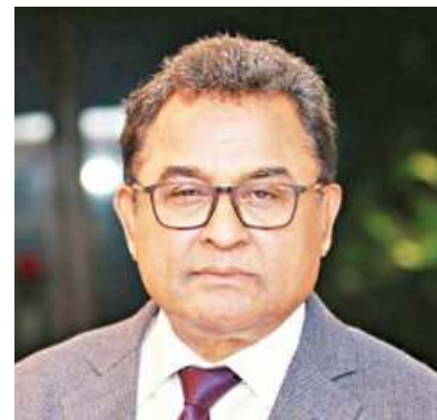
AHM Mustafa Kamal