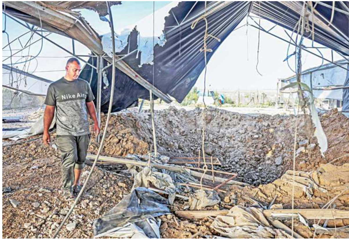
A Palestinian man inspects the damage following Israeli airstrikes on Rafah in the southern Gaza Strip yesterday. Israel carried out the air strikes in response to Palestinian rocket fire into its territory, the Israeli military said.