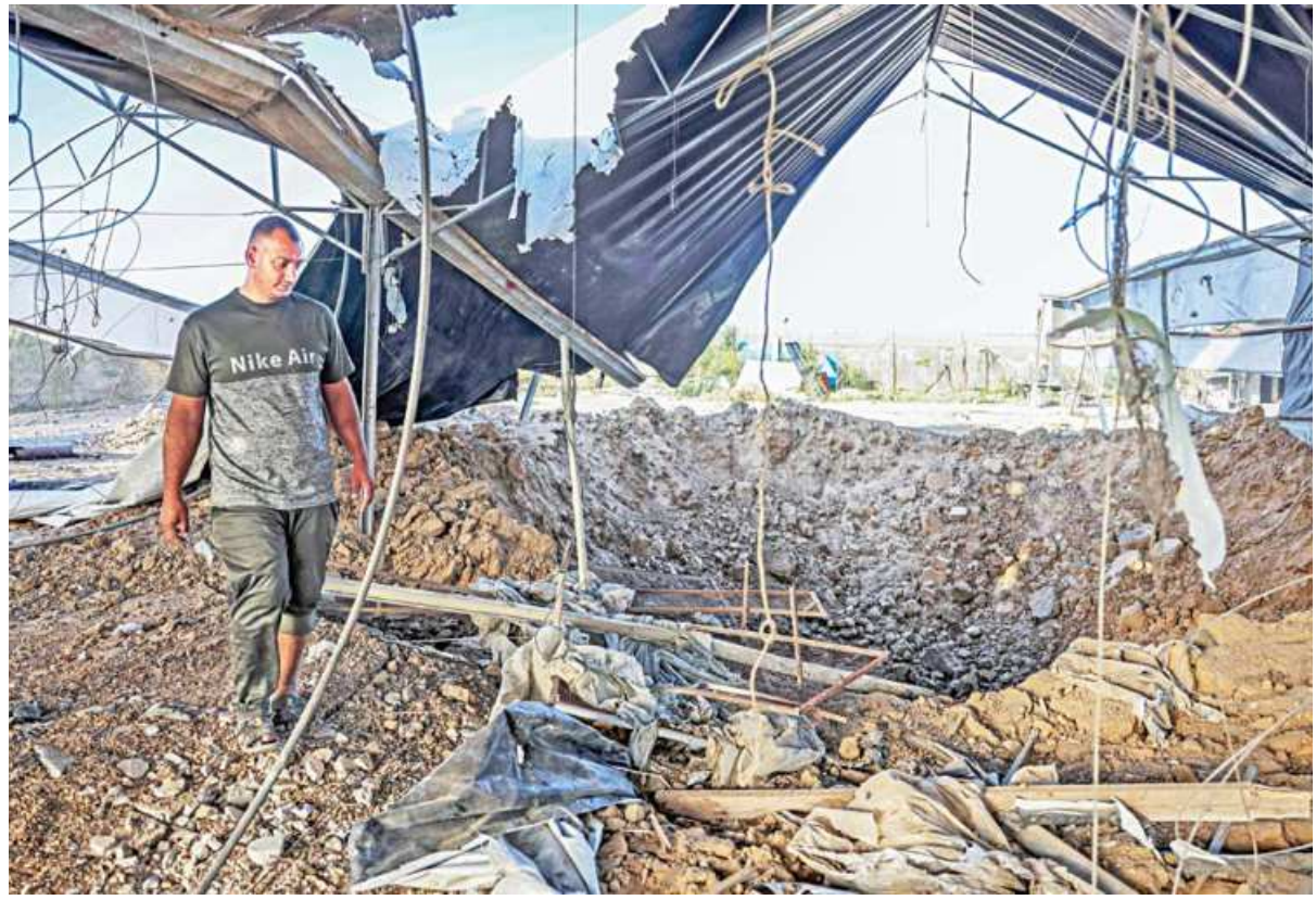
A Palestinian man inspects the damage following Israeli airstrikes on Rafah in the southern Gaza Strip yesterday. Israel carried out the air strikes in response to Palestinian rocket fire into its territory, the Israeli military said.