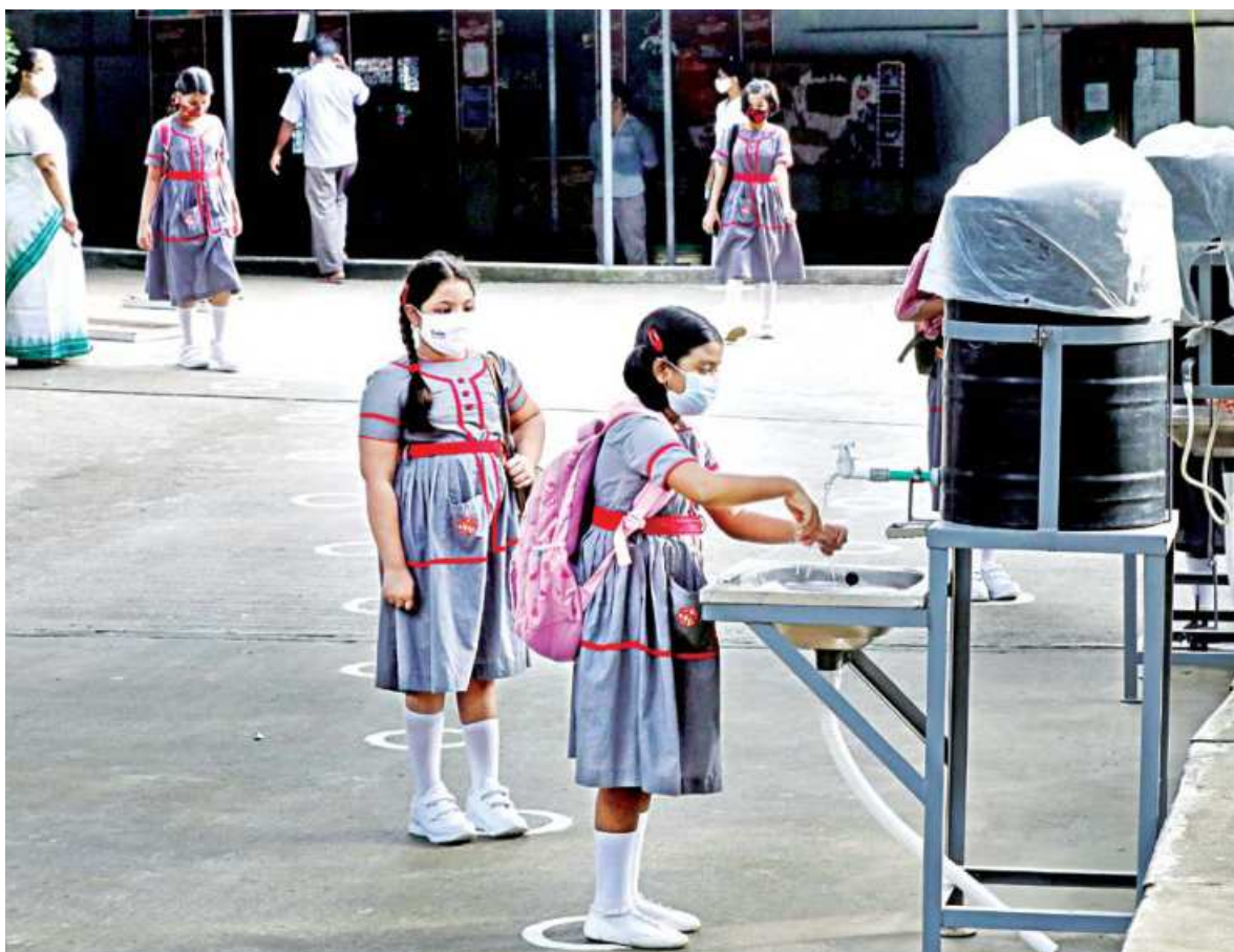
LITTLE ONES SHOW THE WAY... A child washes her hands while another one waits for her turn inside the circle marked on the ground. This photo taken in Holy Cross Girls High School shows how children can follow the rules and health safety guidelines impeccably whereas some adults fail to do so. Yesterday, schools reopened after nearly a year and a half.