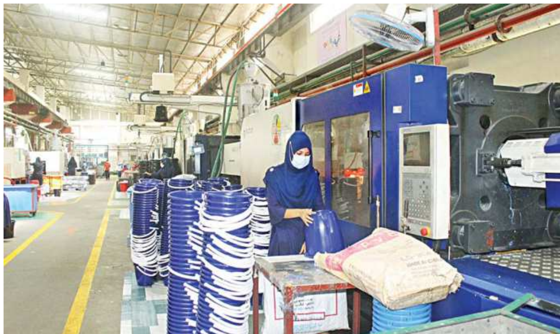
A woman is working at Pran-RFL Plastic Recycle Plant at the conglomerate's industrial park in Habiganj.

Number of plastic goods makers in Bangladesh: 4,000