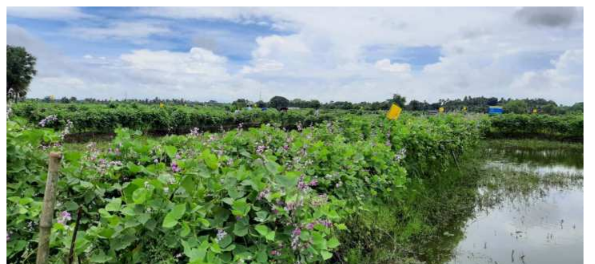
Beans are being cultivated in saline lands in Dumuria upazila of Khulna.

scientists have been able to develop salinity tolerant improved varieties of many crops including paddy, pulses, watermelon, potato, maize, barley, sunflower and vegetables," Razzaque said.