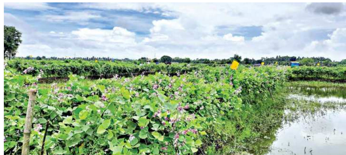
Beans are being cultivated in saline lands in Dumuria upazila of Khulna.

scientists have been able to develop salinity tolerant improved varieties of many crops including paddy, pulses, watermelon, potato, maize, barley, sunflower and vegetables," Razzaque said.