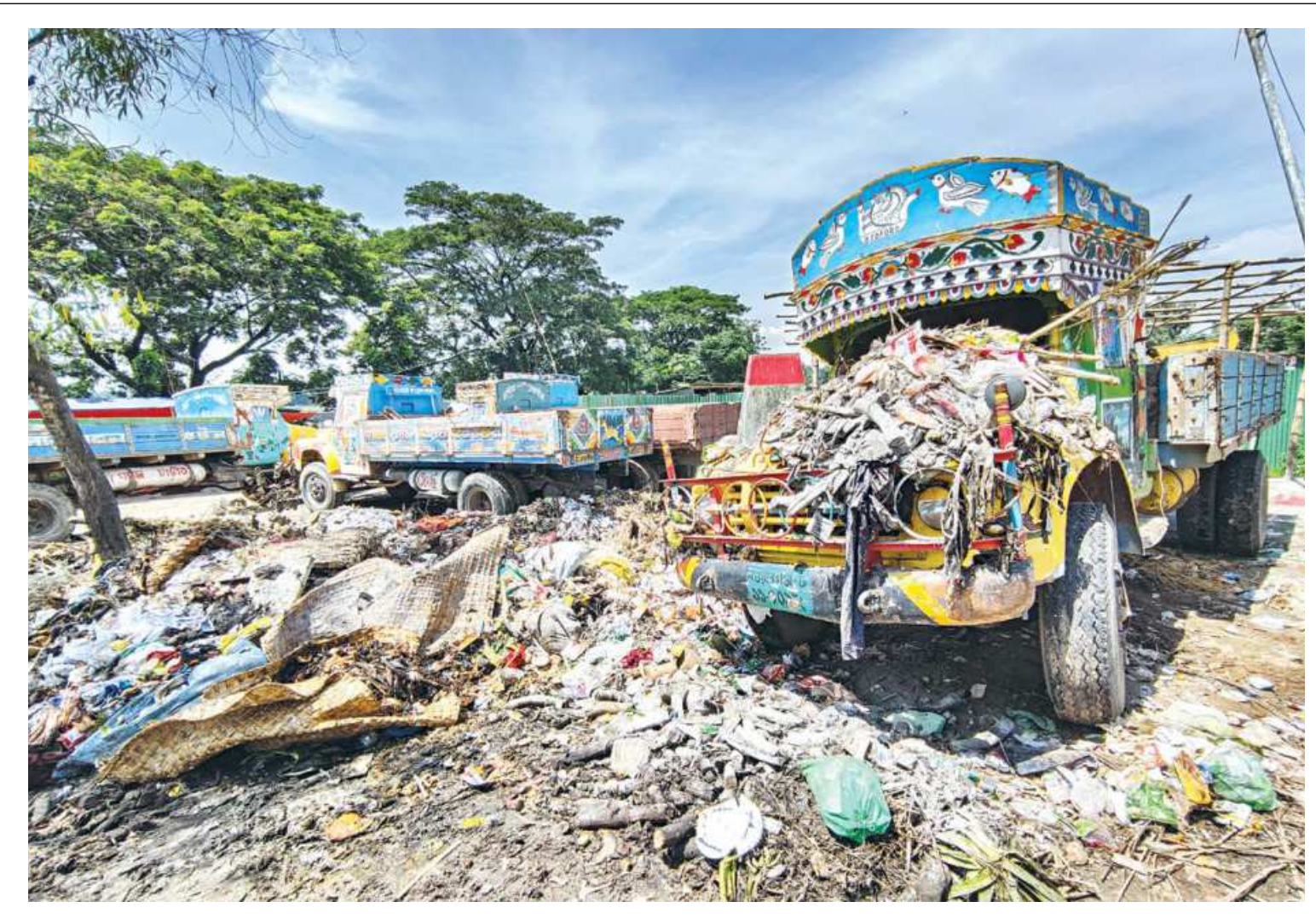
Dhaka North City Corporation workers dumped waste over a truck after the vehicle had wrongfully parked on the yard designated for waste dumping near Mirpur bridge road in the capital. The photo was taken yesterday.