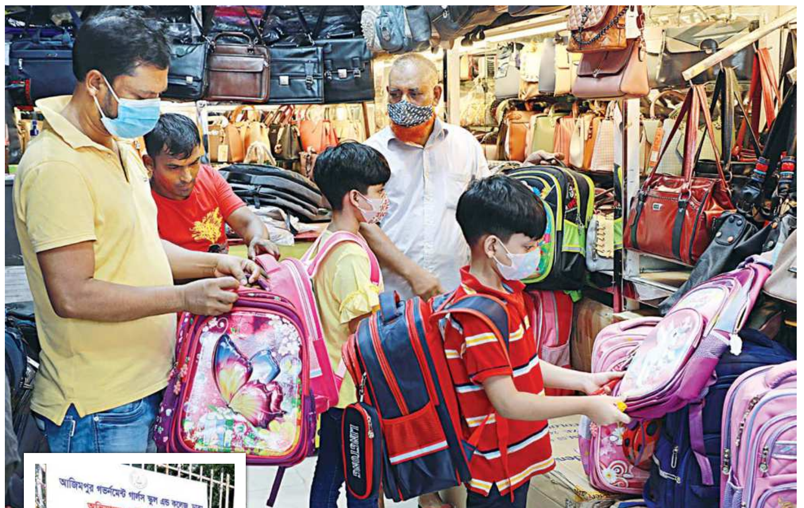
READY TO ROLL ... Children buying bags at a shop selling school supplies. After almost two years, children can now breathe a sigh of relief as they finally get out of their homes and start normal lives again with friends at school. Inset, school authorities prepare the premises for the return of students by hanging up banners listing health safety rules, setting up hand-washing stations and readying school vans.