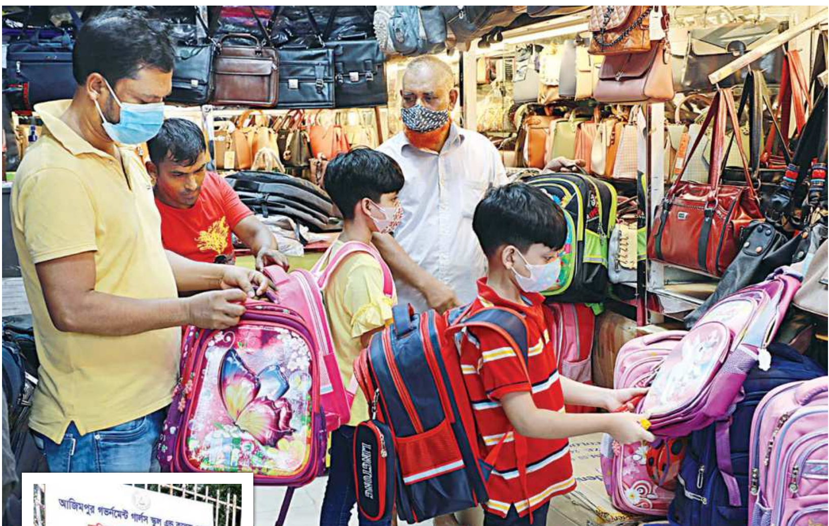
READY TO ROLL ... Children buying bags at a shop selling school supplies. After almost two years, children can now breathe a sigh of relief as they finally get out of their homes and start normal lives again with friends at school. Inset, school authorities prepare the premises for the return of students by hanging up banners listing health safety rules, setting up hand-washing stations and readying school vans.